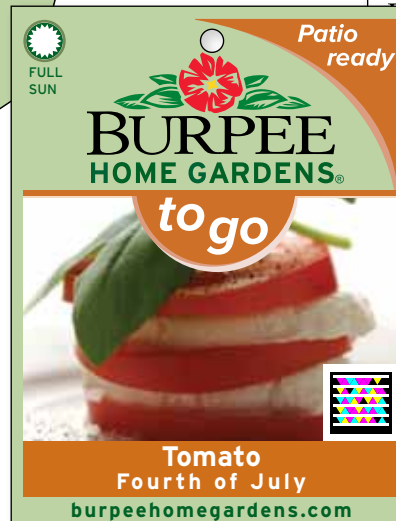
“To Go” Tag (3.25 x 7.2 in.) For patio-ready pots larger than a gallon. Use with stem in planters, or remove perforated stem to hang on plant stake (plant stakes sold separately).