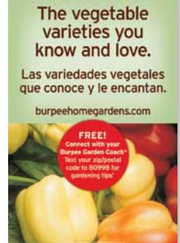
19 x 52-in. Vegetable Vertical Cart Banner