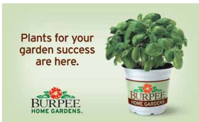
60 x 36-in. Horizontal Store/Fence Banner