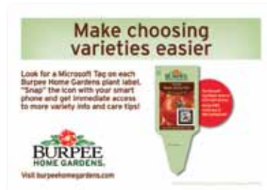
10 x 7-in. Smart Tag Benchcard Download this card and others at ballhort.com/burpeehomegardens