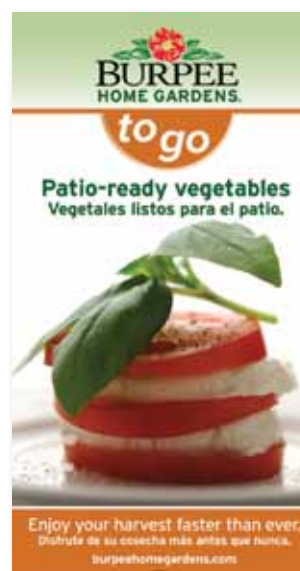
16 x 30-in. "To Go" Sign