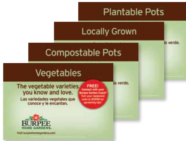
10 x 7-in. Cart/Benchcards