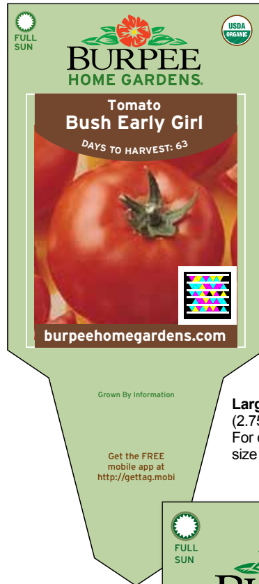
Large Tag (2.75 x 6.2 in.) For quart to gallon size pots