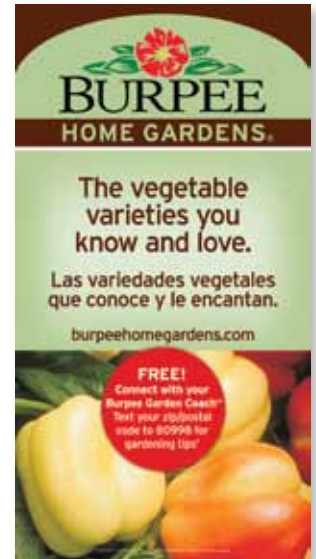
16 x 30-in. Vegetable Sign