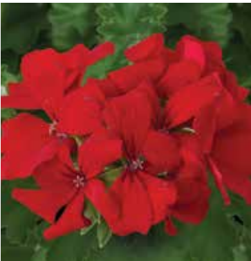
NEW Marcada Dark Red Geranium