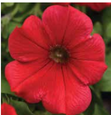
NEW Main Stage Red