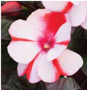
NEW ColorPower White Red Flame New Guinea Impatiens