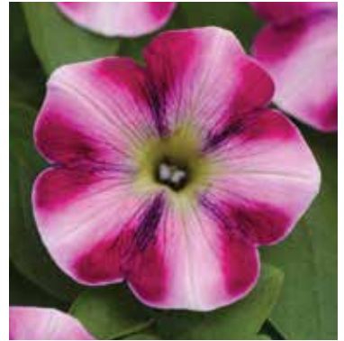
NEW Raspberry Swirl