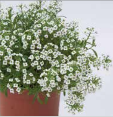
NEW Featherlight Little White Lobularia