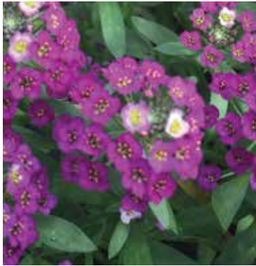
NEW Dark Purple