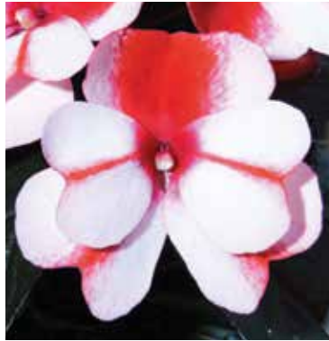
NEW ImPower White Red Flame