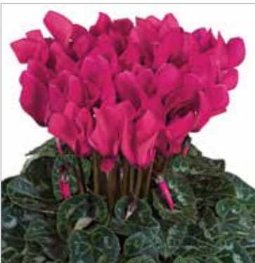
NEW Deep Rose