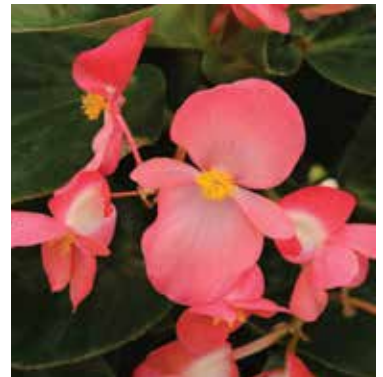
NEW Whopper Rose With Green Leaf Improved