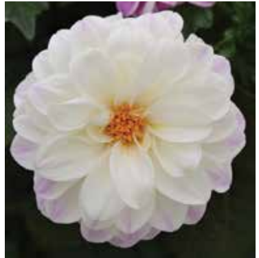
NEW Gardenetta Lavender Swirl Dahlia

Meets the coral and orange color trend and has a truly stunning yellow center.