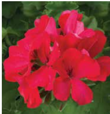
NEW Marcada Magenta Geranium