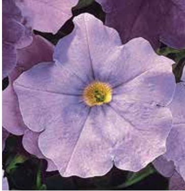
NEW Main Stage Light Blue Petunia