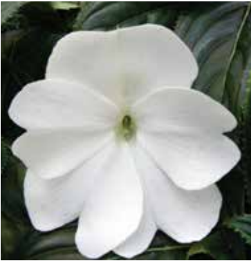
NEW ImPower White