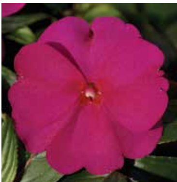
NEW ImPower Purple Blue