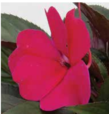
NEW ImPower Electric Purple