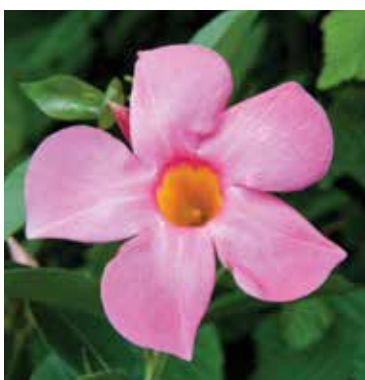
NEW Dundee Pink Mandevilla