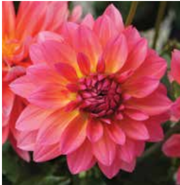
NEW Gardenetta Passion Fruit Dahlia

Meets the coral and orange color trend and has a truly stunning yellow center.