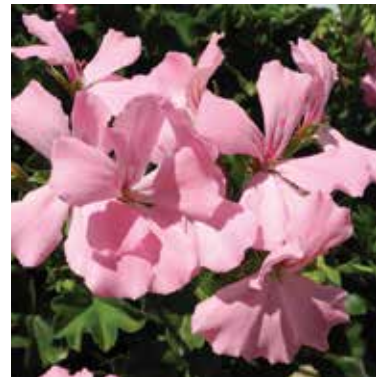
NEW Marcada Pink Geranium