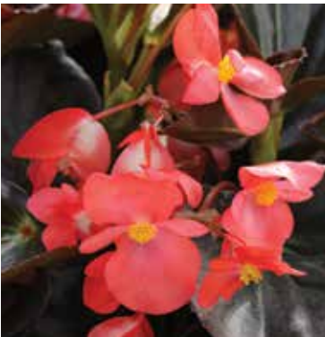
NEW Whopper Red With Bronze Leaf Improved