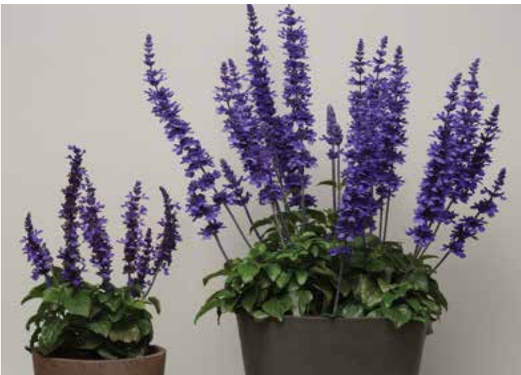
◀ NEW Mysty Salvia (left) and NEW Mystic Spires Improved (right)