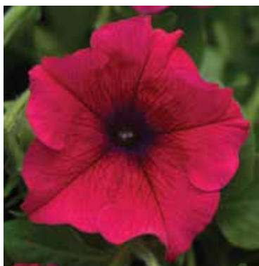
NEW Main Stage Hot Pink