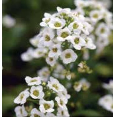
NEW Featherlight White Lobularia