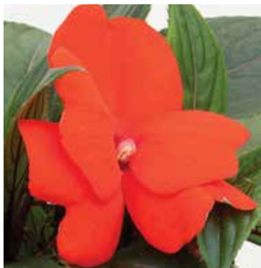
NEW ImPower Orange