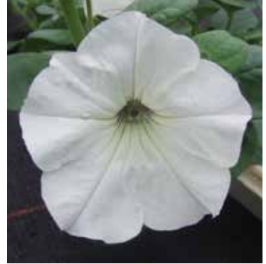
NEW Main Stage White Petunia