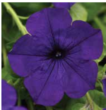
NEW Main Stage Violet