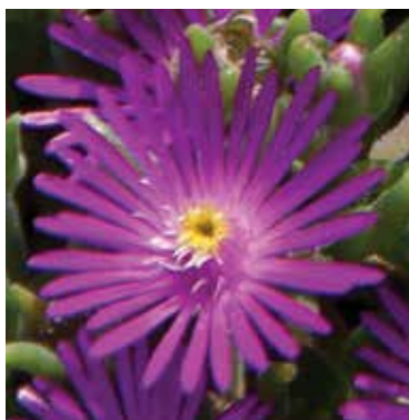
NEW Hot Pink