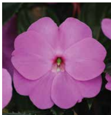
NEW ImPower Lavender