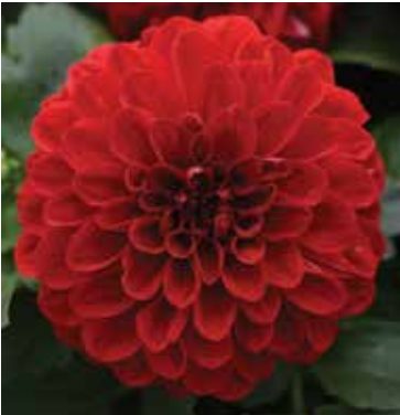
NEW Gardenetta Dark Red Dahlia