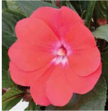
NEW ImPower Salmon+Eye