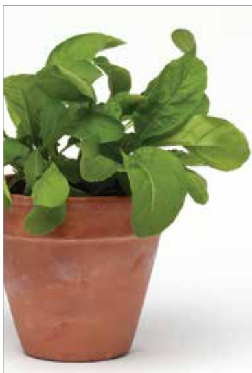
◀ (left to right) SimplyHerbs Basil, 'Try Basil' and Sage