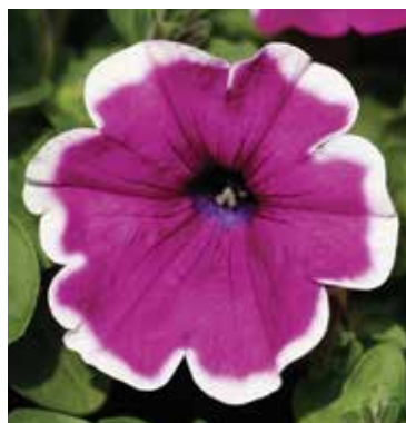
NEW Main Stage Violet Picotee