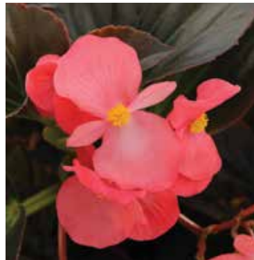
NEW Whopper Rose With Bronze Leaf Improved