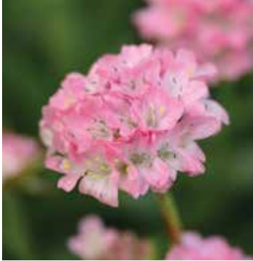
NEW Daydream Shows bright pink flowers from Spring until Fall.