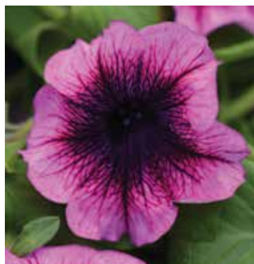
NEW Main Stage Blueberry