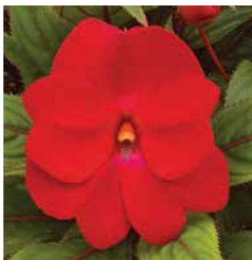
NEW ImPower Dark Red