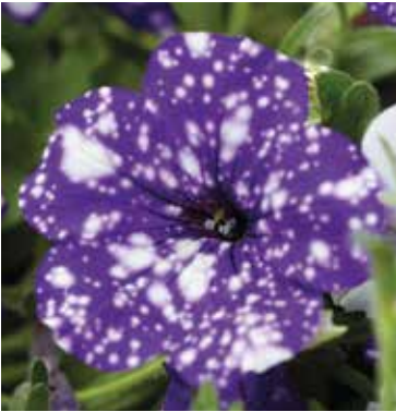
NEW Night Sky

Original Night Sky is now part of the Headliner series! Fits series for flower timing and habit.