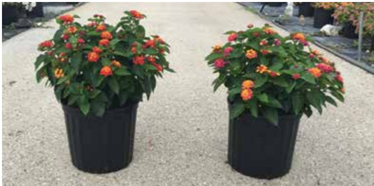
NEW Bloomify Red (left) and market-leading red (right)