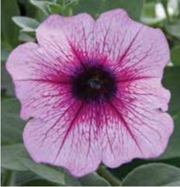
NEW Main Stage Pink Vein Petunia