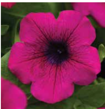
NEW Main Stage Purple