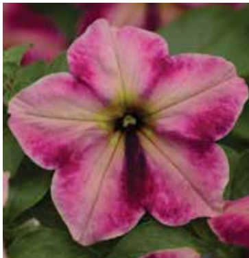
NEW Cherry Star