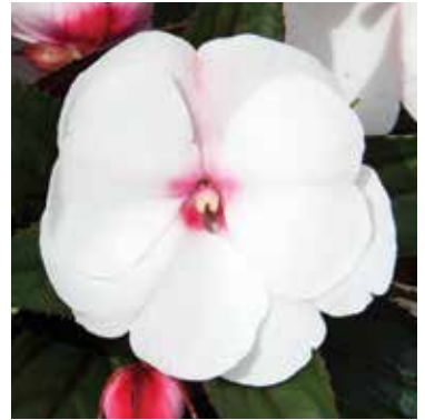
NEW ImPower White Pink Eye