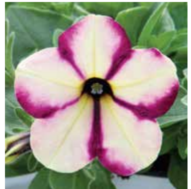
NEW Banana Cherry Swirl