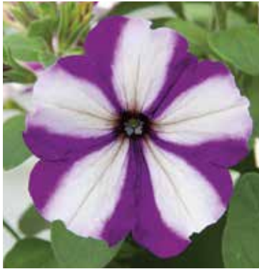
NEW Blueberry Swirl

Original Night Sky is now part of the Headliner series! Fits series for flower timing and habit.