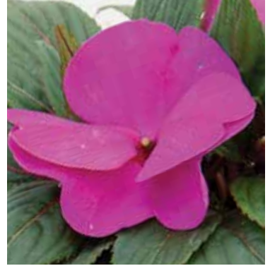
NEW ImPower Violet