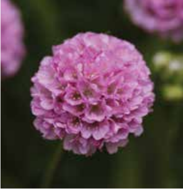
NEW Sweet Dreams Attractive lavender-mauve flowers from Spring to Fall.