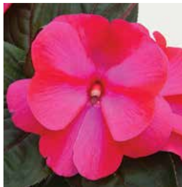
NEW ImPower Red Flame