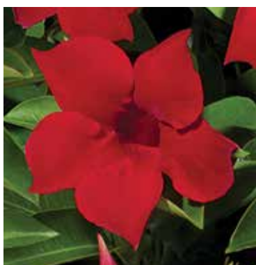
NEW Dundee Red Mandevilla