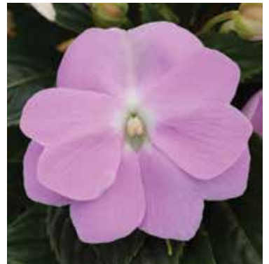
NEW ColorPower Orchid New Guinea Impatiens