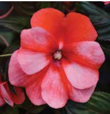
NEW ColorPower Red Flame New Guinea Impatiens