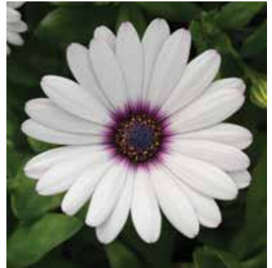
NEW White Amethyst