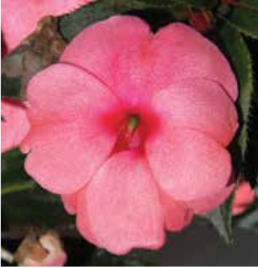
NEW ImPower Salmon