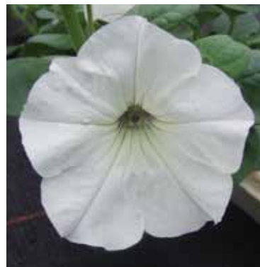
NEW Main Stage White Petunia