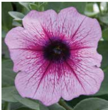
NEW Main Stage Pink Vein Petunia