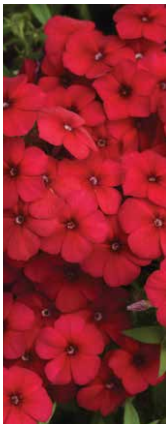
Gisele Red Phlox