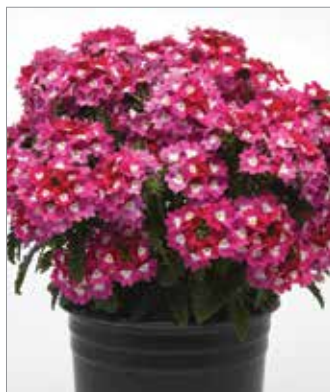
Cadet Upright Hot Pink Wink Improved Verbena