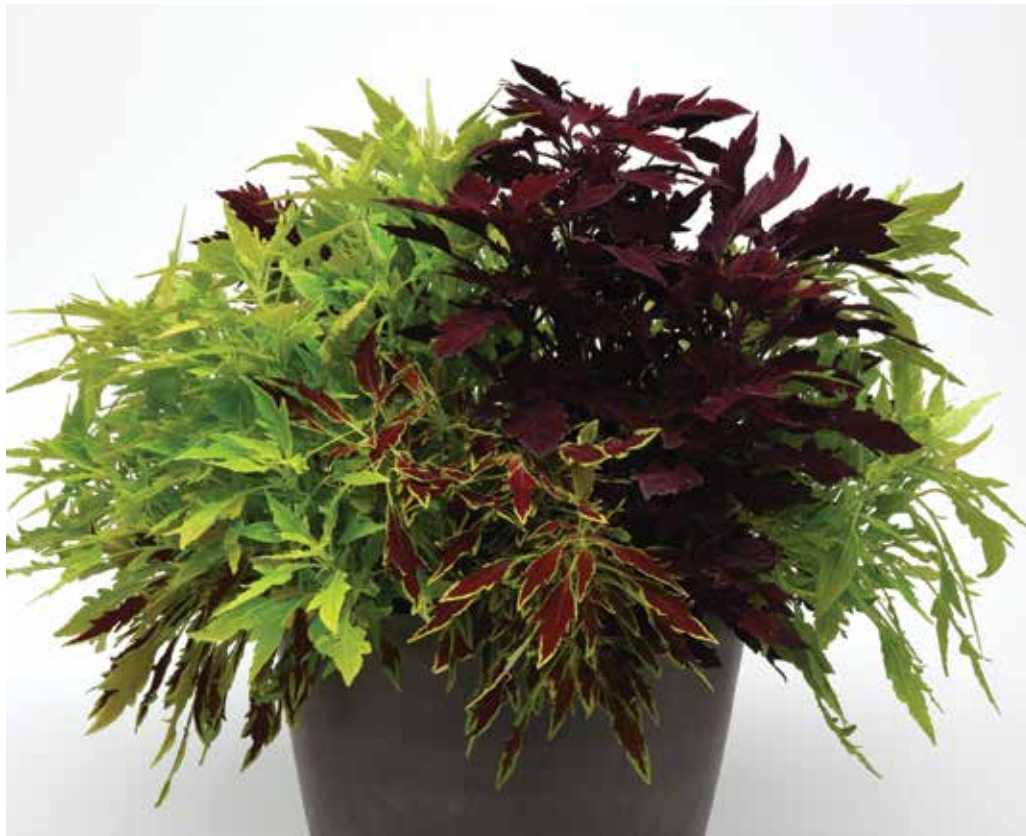
MixMasters Pico de Gallo