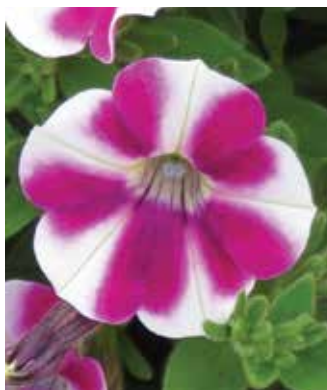
Surfinia Purple Heart