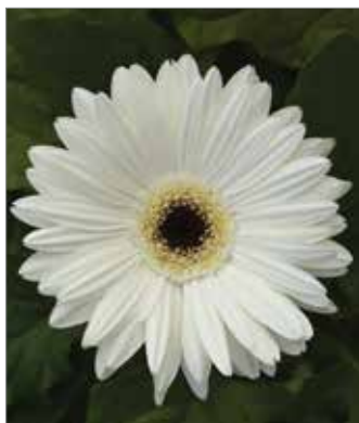
ColorBloom White with Dark Eye