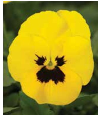
Quicktime Yellow Blotch Viola