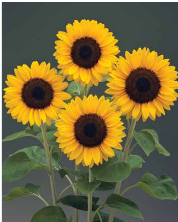
Sunrich Orange Summer DMR Sunflower