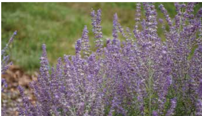
Sage Advice Perovskia