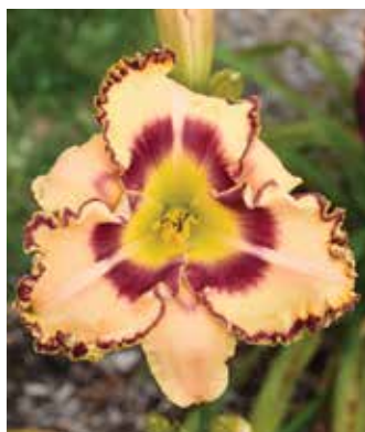
Rainbow Rhythm King of the Ages Hemerocallis