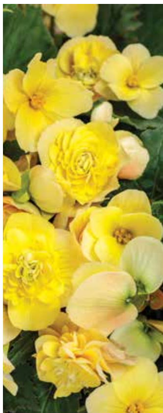
Double Delight Primrose