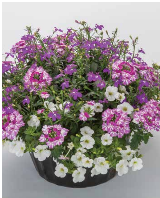
Kwik Kombos All That Glitters Mix