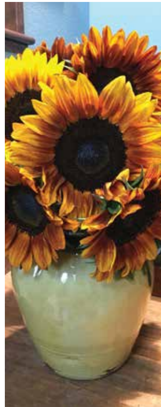
Pro Cut Bicolor DMR Sunflower