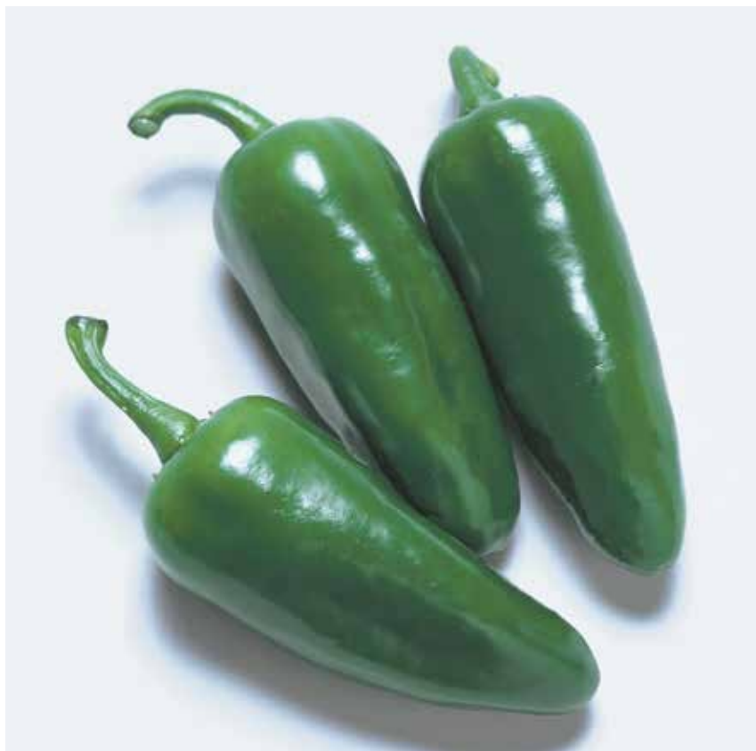
Jalapeño Sweet Poppers

Thick-walled, juicy purple bell has better eating qualities than others on the market. Holds purple stage for a long time, so it has a good harvest window when purple which continues on through ripening to red.