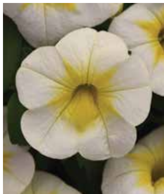
Cha-Cha Frosty Lemon Calibrachoa