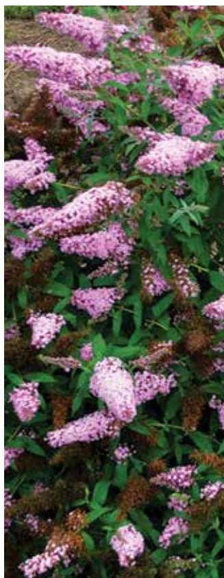
Monarch 'Princess Pink' Buddleia