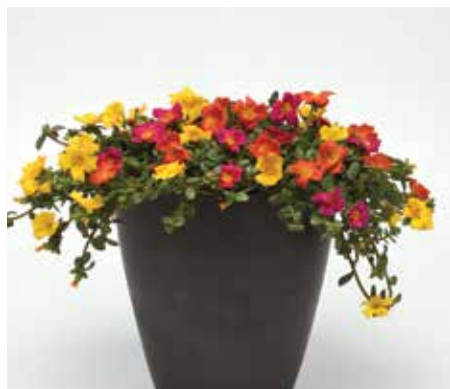
MixMasters Retro Summer