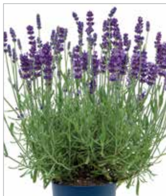
BeeZee Dark Blue