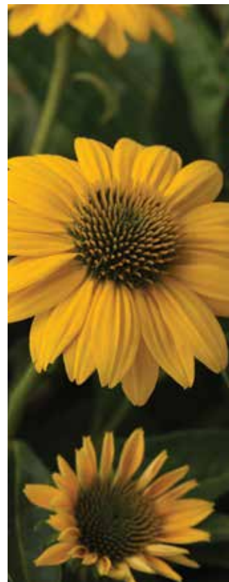
Sombrero Poco Yellow