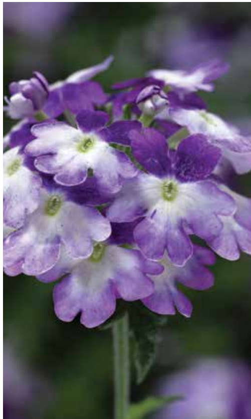
Tuscany Twister Purple Shades Verbena