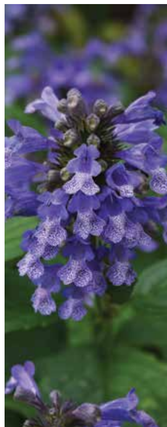
Whispurr Blue Nepeta