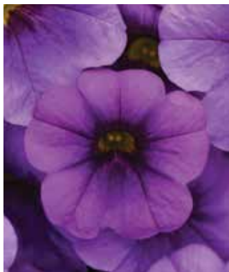
Cha-Cha Deep Blue Calibrachoa