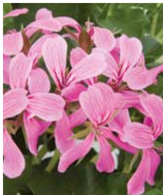
Decora Light Purple