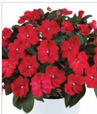
Sol Luna Candy Apple