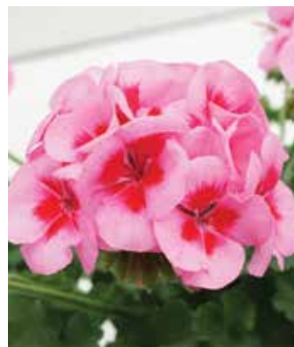
Sunrise Rose+Big Eye