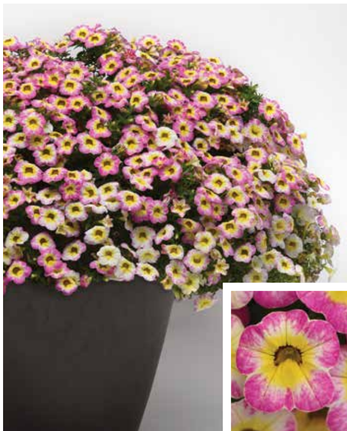
Cha-Cha Diva Hot Pink Calibrachoa