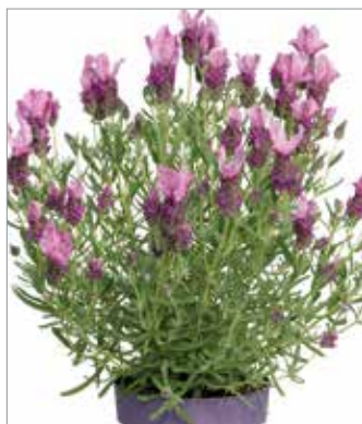
Libelle Compact Rose