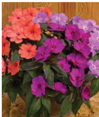
SunPatiens Compact Hawaiian Sunset Mix