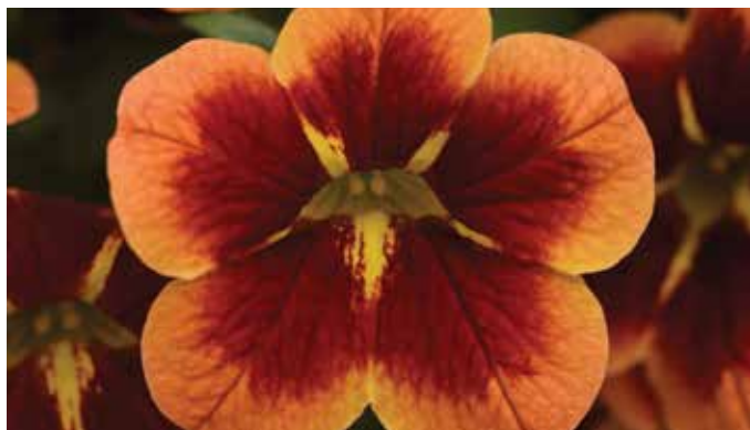
Bumble Bee Orange Calibrachoa