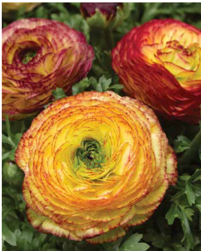
Maché Lemon Rose Bicolor Ranunculus