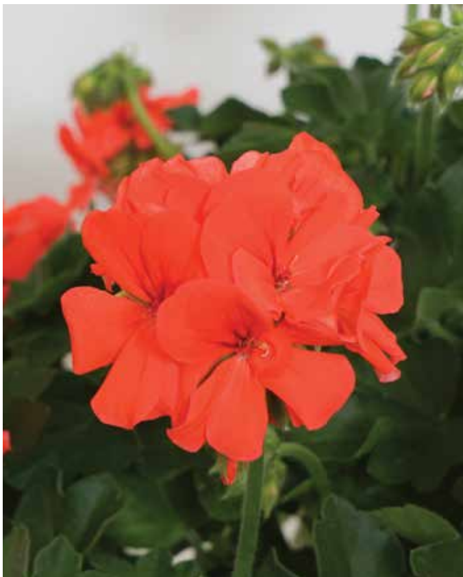
Marcada Deep Coral Geranium