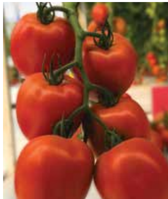
Venti Salad Tomato