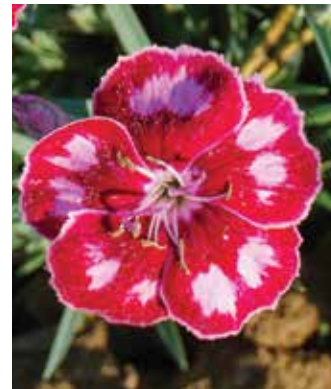
Mountain Frost Ruby Glitter