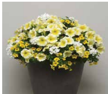
MixMasters Sunnyside Improved