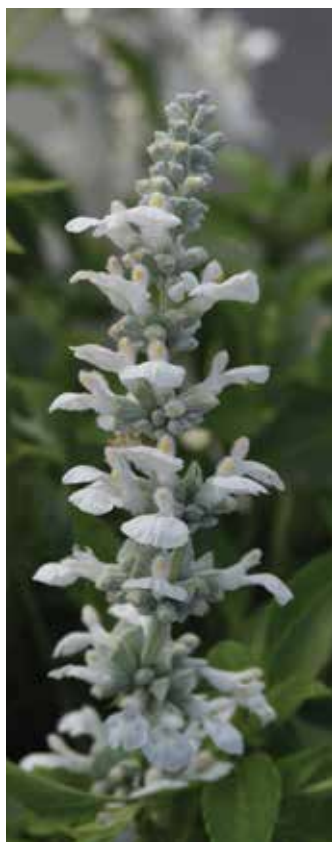
'White Flame' Salvia