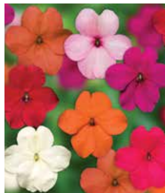
Imara XDR ProFormula Mix Impatiens