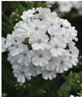
Super Ka-Pow White