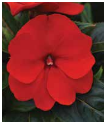
ColorPower Red New Guinea Impatiens

Upgraded for slightly higher vigor and later flowering. Features small, round, needle-like foliage and a compact, mounding habit.