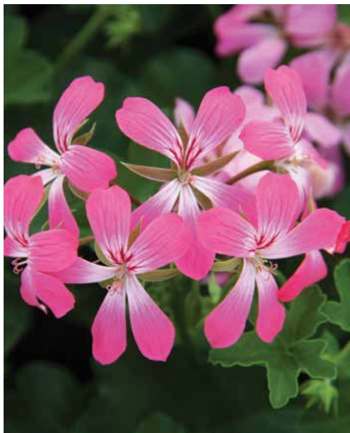
Balcon Ice Dance Pink