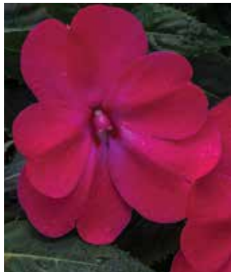
SunPatiens Compact Rose Glow