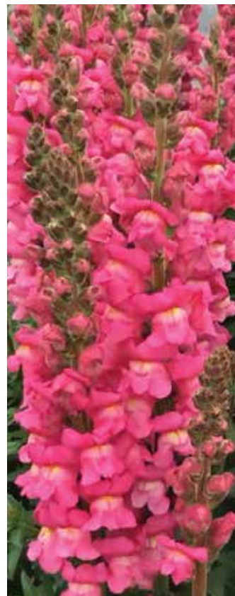
Maryland Rose Snapdragon

(Group 1,2) Well-suited to cool-season, low-light/low-temperature conditions.