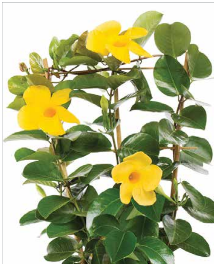
Diamantina Opal Yellow Improved Dipladenia