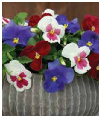
Spring Grandio Star Spangled Mix Pansy