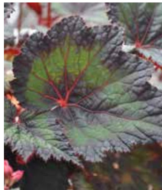
Dibs Thin Mint Begonia