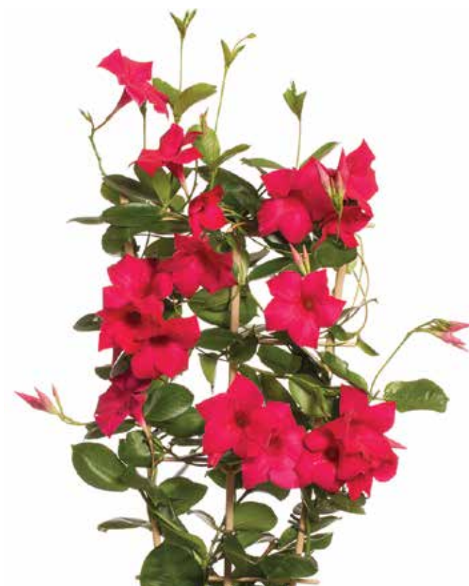
Diamantina Tourmaline Fuchsia Bush Mandevilla