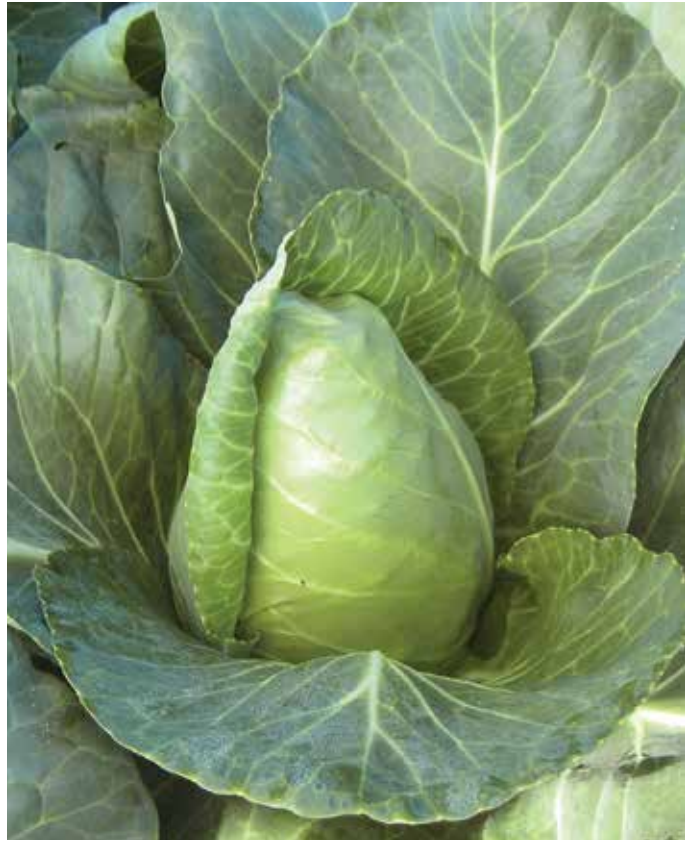
Sweet Slaw Cabbage

Good quality Cello/Jumbo carrot for the Northeast and Canada. Also makes a smooth, cylindrical, high-quality root in a variety of soil types in the Midwest.