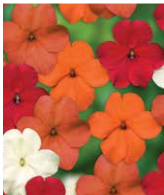
Imara XDR Hot! Mix Impatiens