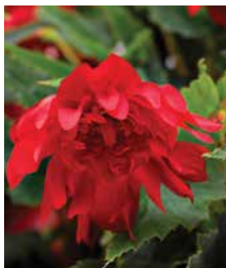
Grace Dark Red