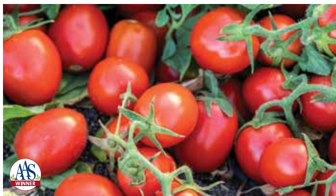
Early Resilience Tomato

2020 All-America Selections National Winner is a rounded Roma with a deep red interior color, uniform maturity and good quality interior for canning and cooking. Bushy plants can be staked but it is not necessary.