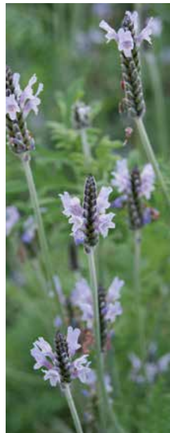
Torch Minty Ice Lavender