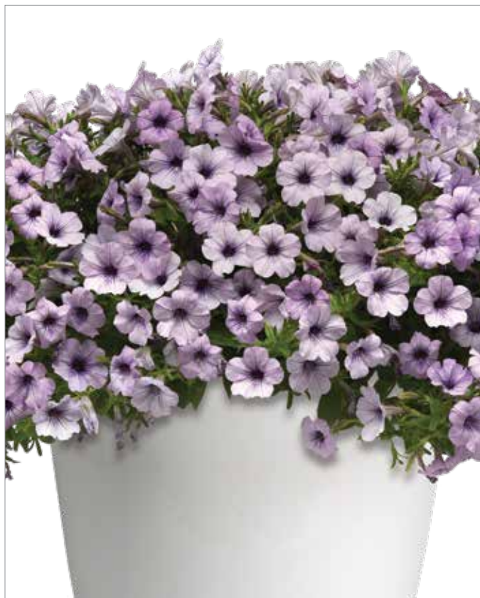
Headliner Crystal Sky