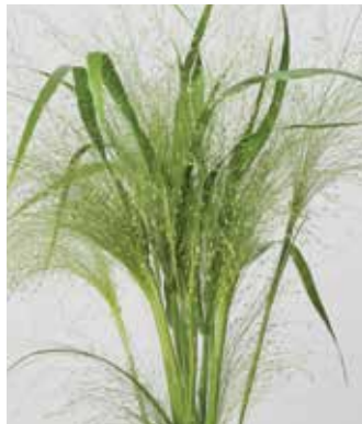
Frosted Explosion Grass Panicum