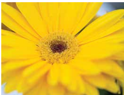
Majorette Yellow Dark Eye Improved