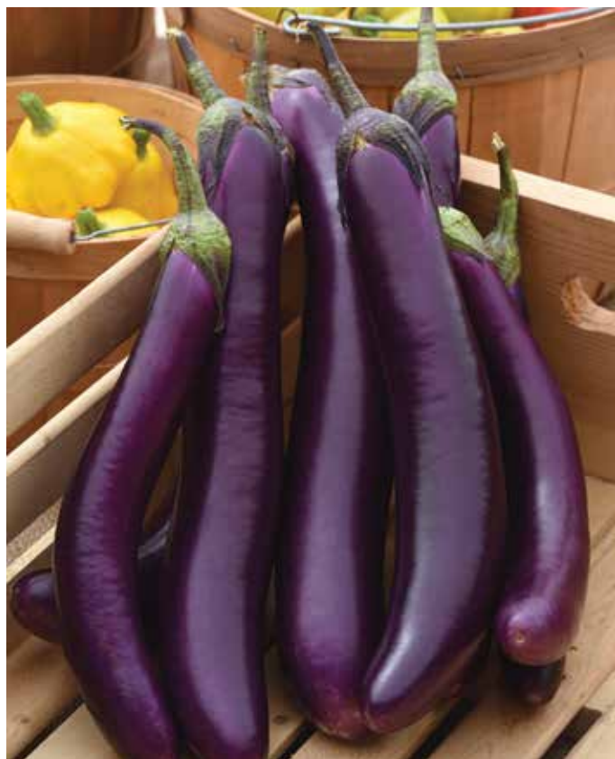
Asian Delite Eggplant