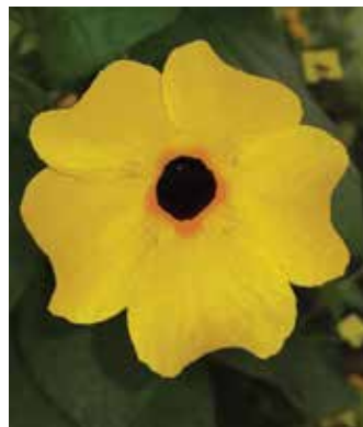
TowerPower Gold Thunbergia