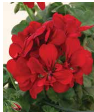
Royal Dark Red 21