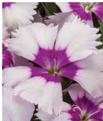
Venti Parfait Blueberry Eye Dianthus