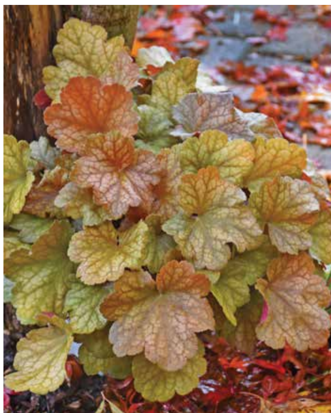
Dolce Toffee Tart Heuchera