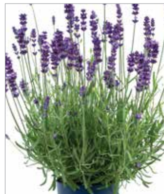
BeeZee Power Blue