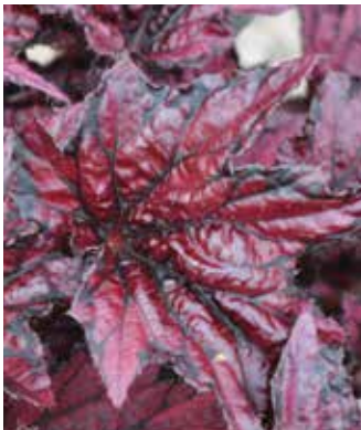
Bewitched Cherry Begonia