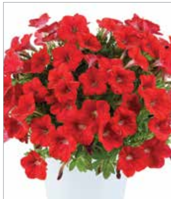
Scoop Cherry Gelato