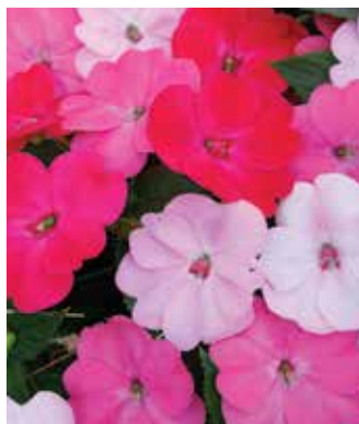
SunPatiens Compact Happy Days Mix