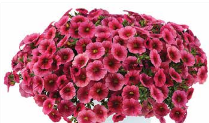
Colibri Malibu Pink