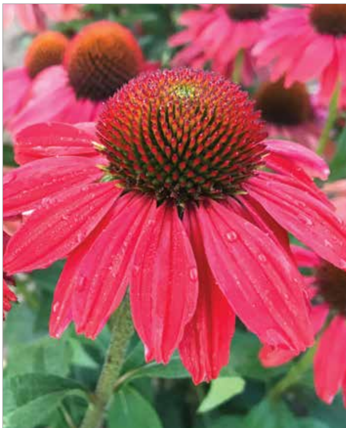
Color Coded Frankly Scarlet