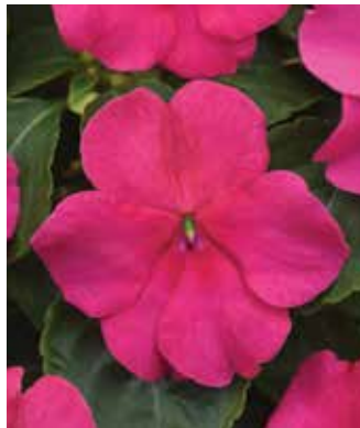
Beacon Rose Impatiens