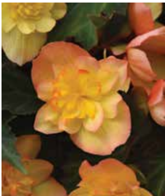
Compact Double Apricot Begonia