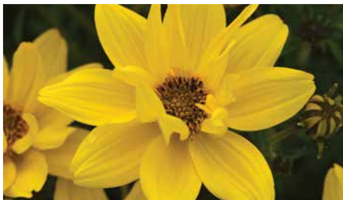
Sun Drop Compact Double Yellow Bidens