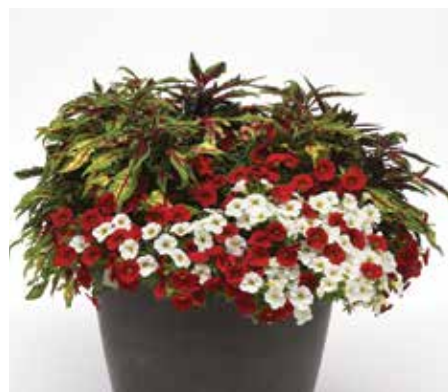
MixMasters Hot Rod