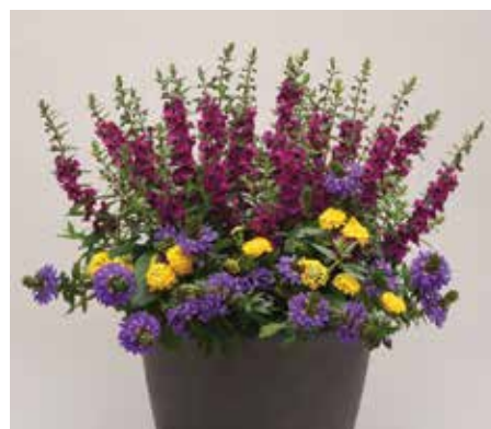
MixMasters Porch Patriot Improved