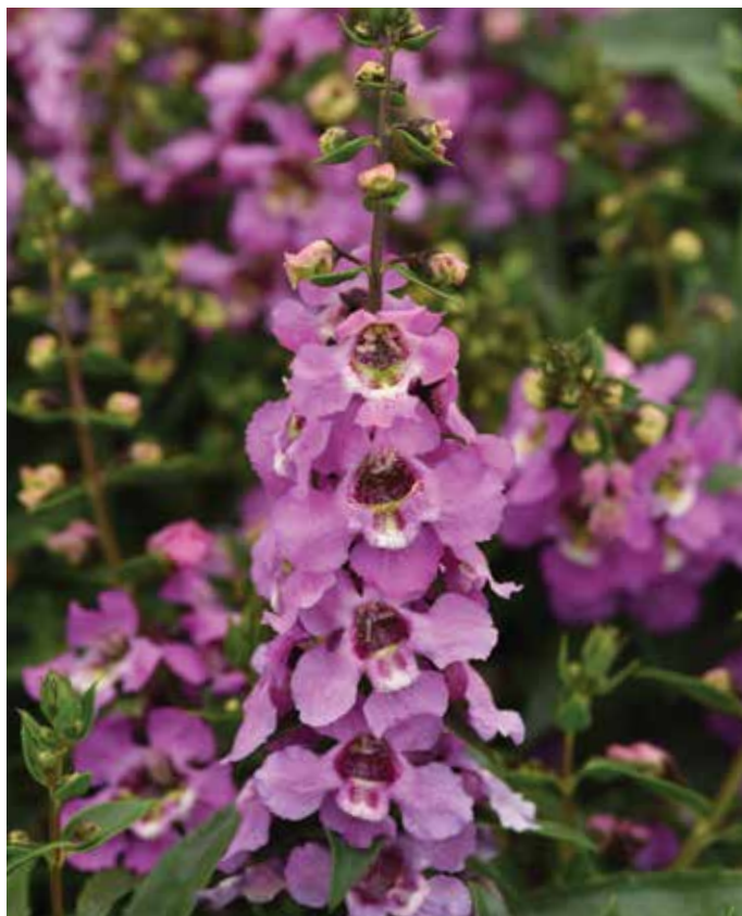
Serenita Lavender Angelonia