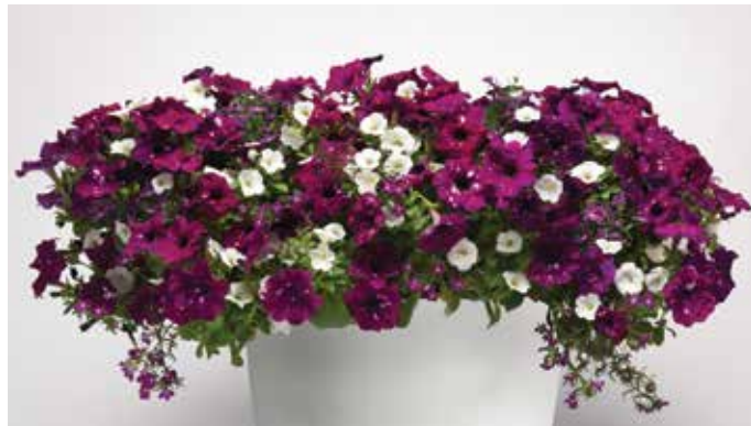
Trixi Chemical Attraction