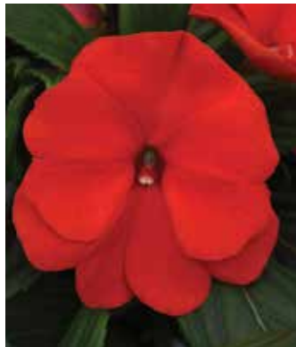
ColorPower Orange New Guinea Impatiens