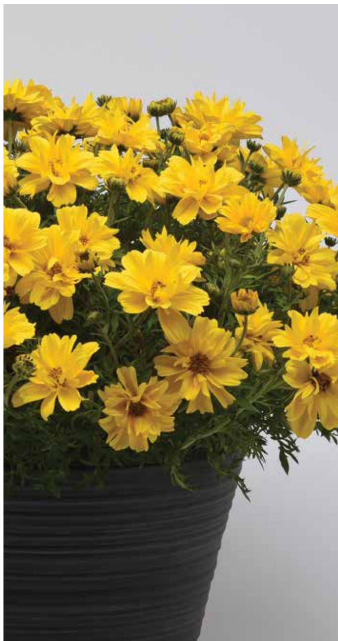
Sun Drop Double Yellow Bidens