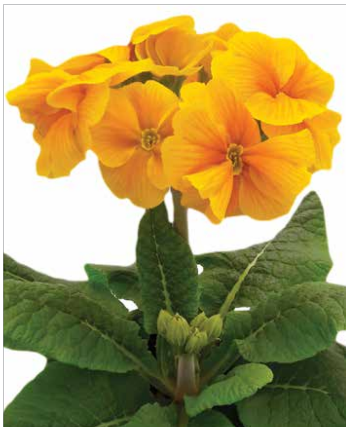
SuperNova Orange Primula