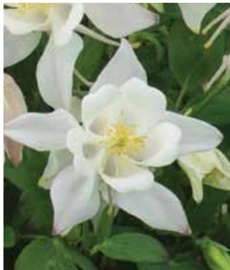
Earlybird White Aquilegia