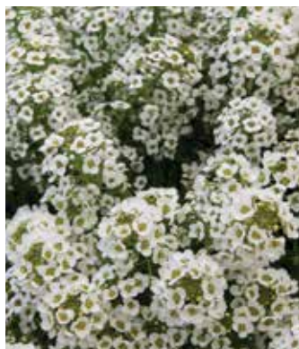
North Face White Alyssum