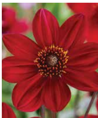
Dahlegria Red Improved