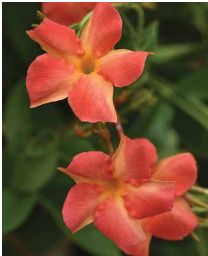
Diamantina Coral Orange Sunrise Dipladenia