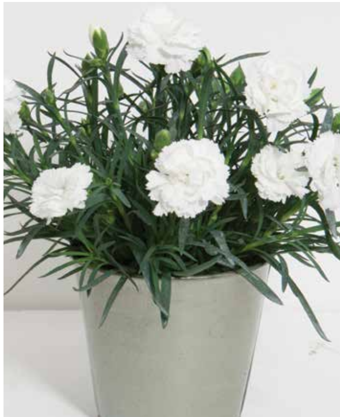
SuperTrouper White 21 Dianthus