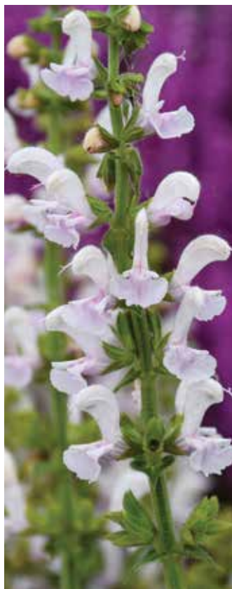
Color Spires Snow Kiss Salvia