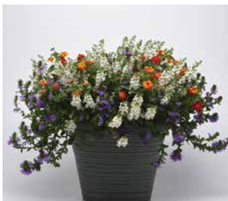
MixMasters Bloom Of Allegiance Improved