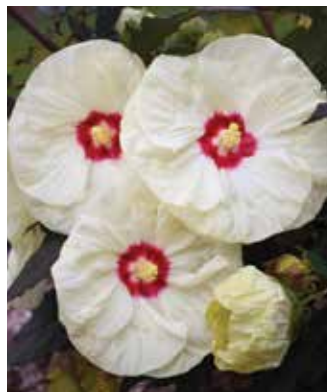
Summerific French Vanilla Hibiscus