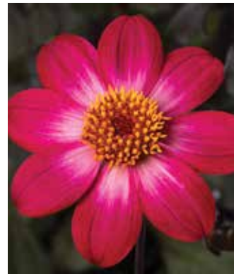
Dahlegria Magenta Bicolor