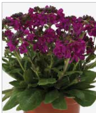
Barranca Deep Rose Arabis