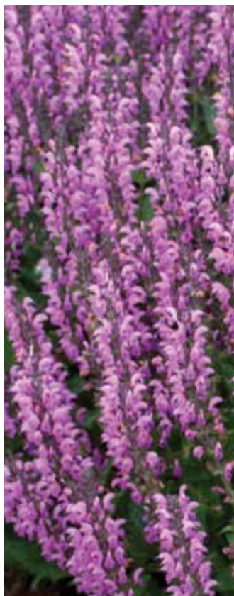
Color Spires Back to the Fuchsia Salvia