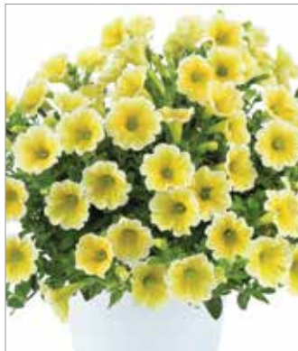
Scoop Lemon Ice