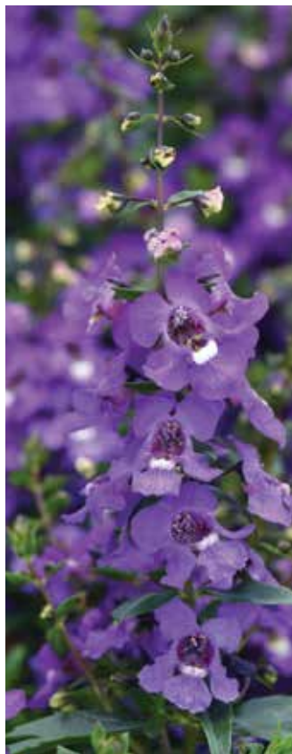
Serena Blue Improved Angelonia