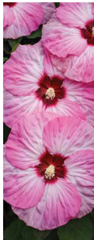
Summerific Spinderella Hibiscus