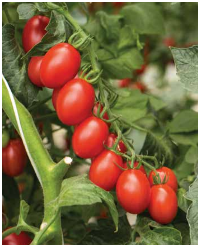
BOOST Tasti-Wee Tomato