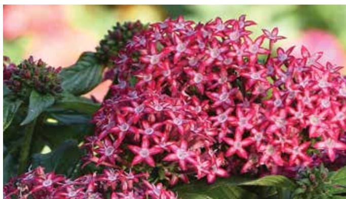
Glitterati Red Star Pentas