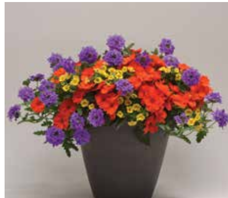
MixMasters Peach of My Heart Improved