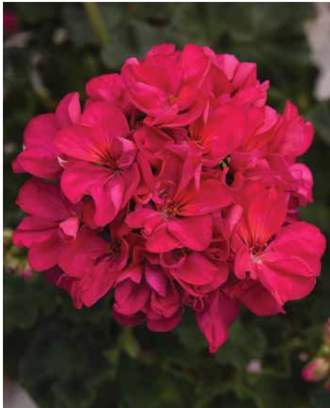
Presto Violet Improved