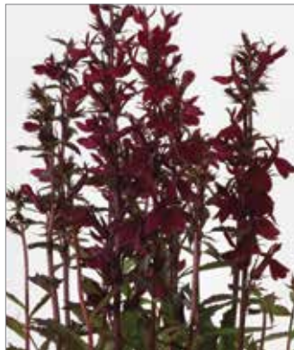
Starship Burgundy Lobelia