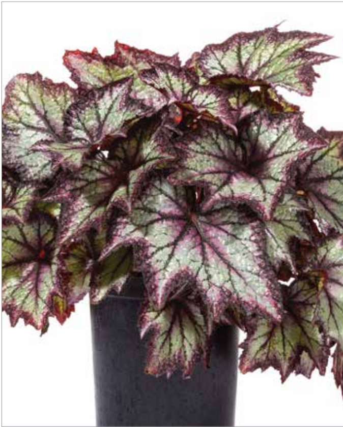
Bewitched Lavender Begonia