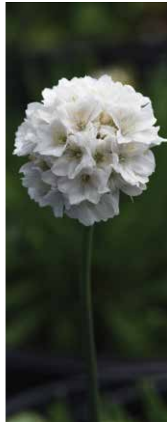
Dreameria 'Dream Clouds' Armeria