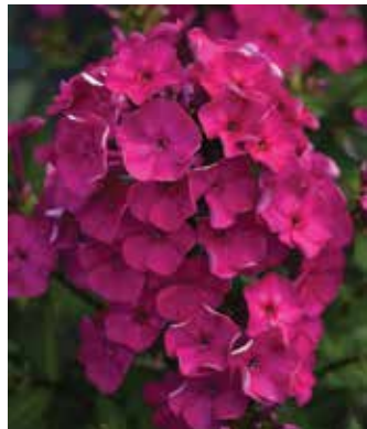
Super Ka-Pow Fuchsia