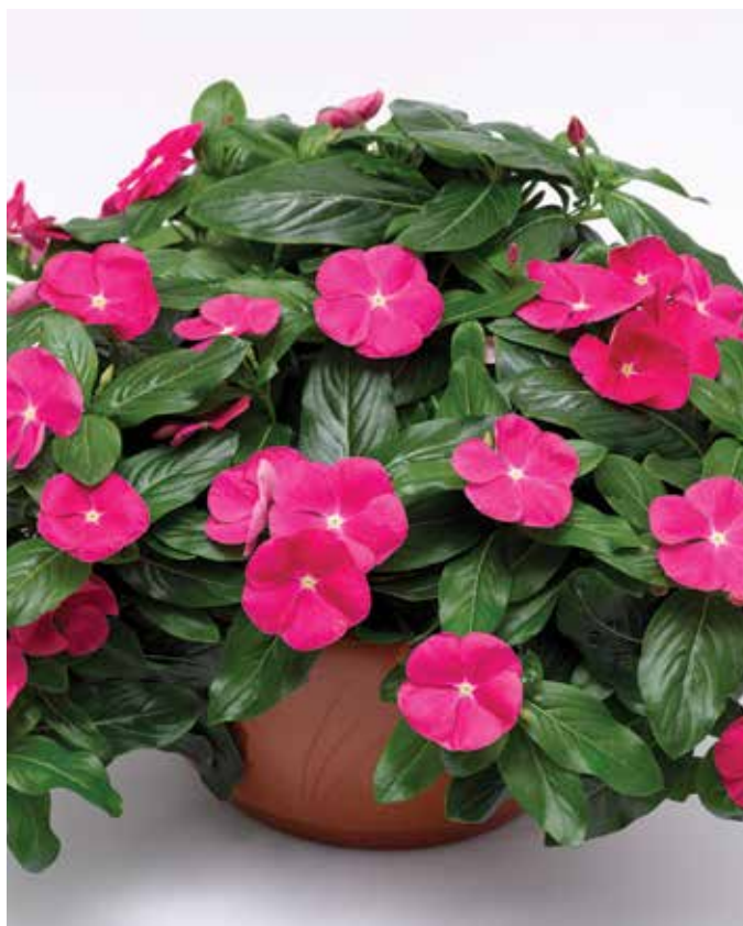
Cora Cascade Bright Rose Vinca