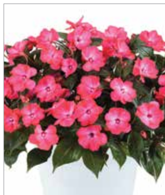
Sol Luna Tropical Punch