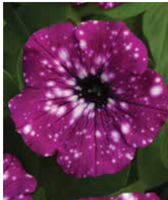
Headliner Electric Purple Sky