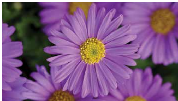
Fresco Purple Brachyscome