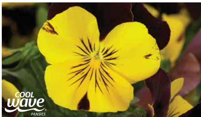
Cool Wave Sunshine 'N Wine Improved Pansy