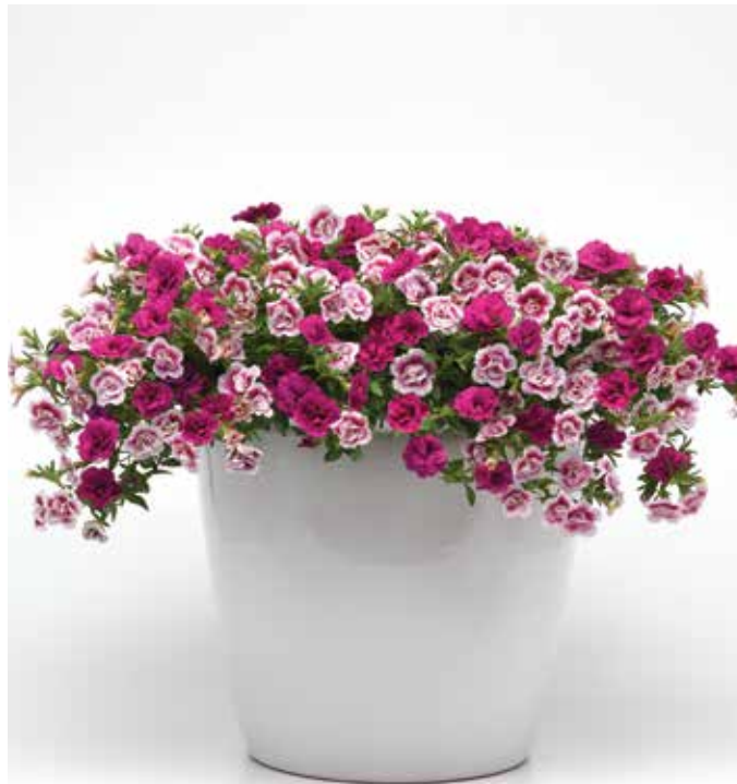
Trixi Two to Tango