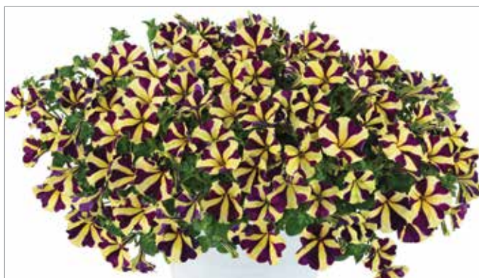
Amore Heart &amp; Soul Petunia