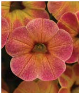
Cha-Cha Diva Apricot Calibrachoa