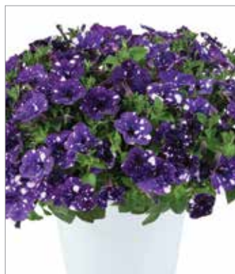
Splash Dance Bolero Blue