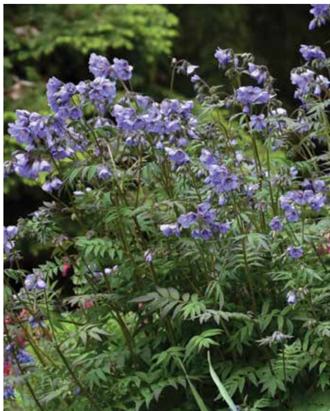
Heaven Scent Polemonium