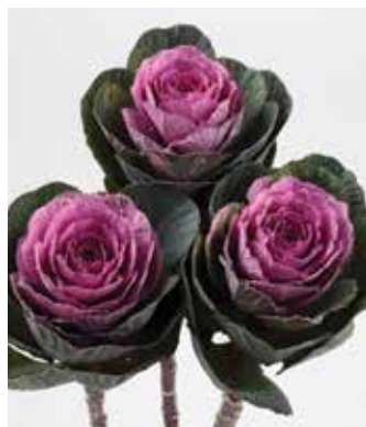
Condor Red Flowering Kale