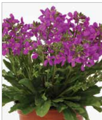
Barranca Pink Arabis