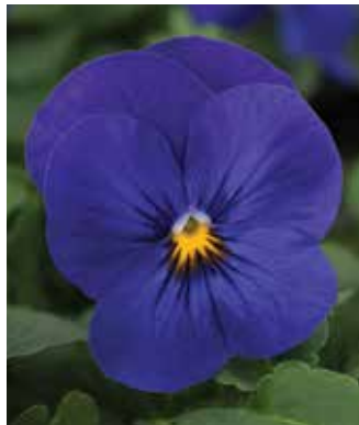
Quicktime Blue Viola