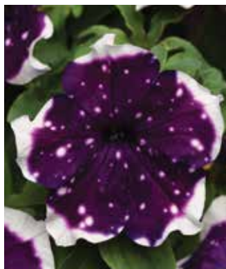
Main Stage Glacier Sky