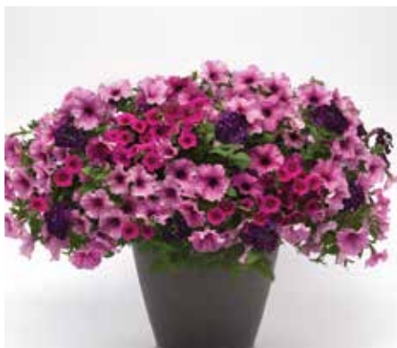
MixMasters A Grape Fit! Improved