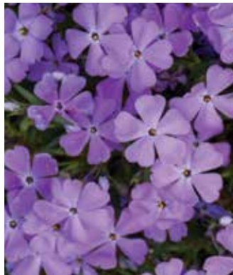
Mountainside Crater Lake Phlox