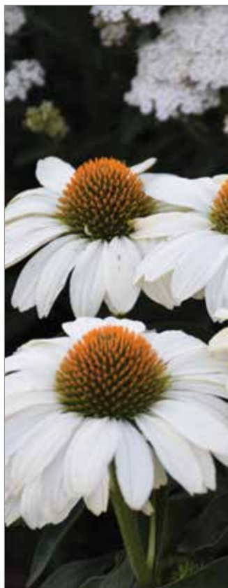
Color Coded The Price is White