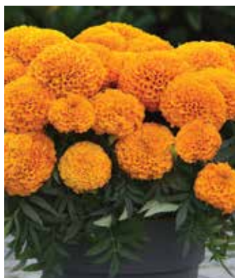
Marvel II Orange African Marigold