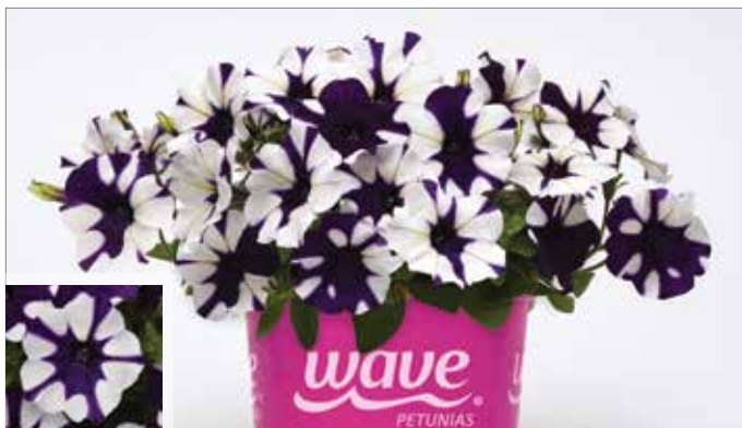
Shock Wave Purple Tie Dye Petunia