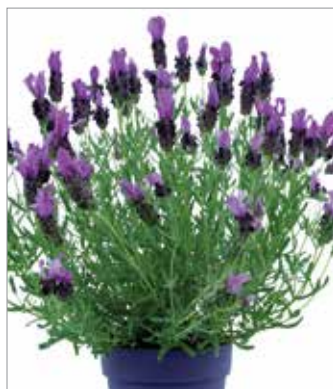
Libelle Compact Blue