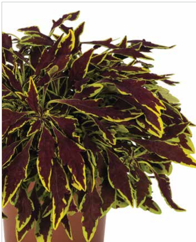
Le Freak Coleus