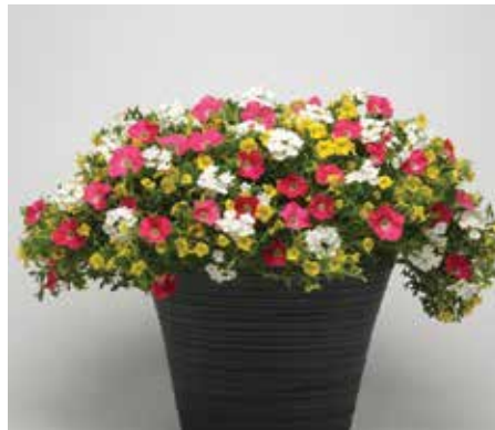
MixMasters Paradise Sunrise Improved