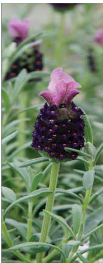
LaVela Compact Dark Violet 21