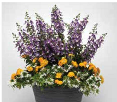
MixMasters Gold Plated