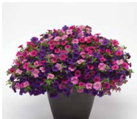
MixMasters Sweet Melody Improved