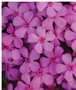
Spring Bling Ruby Riot Phlox