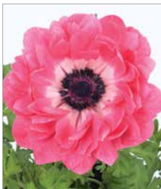
Harmony Double Pink Anemone