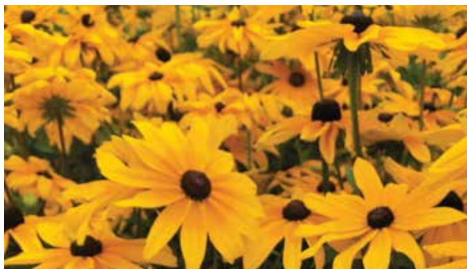
Cheyenne Gold Rudbeckia