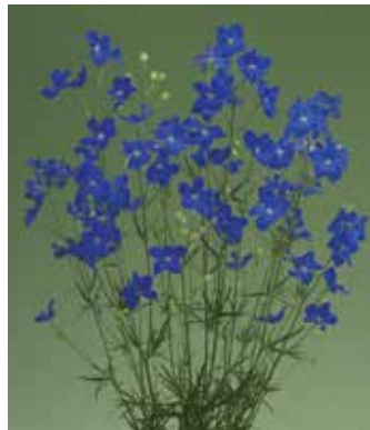
Jenny's Pearl Blue Delphinium