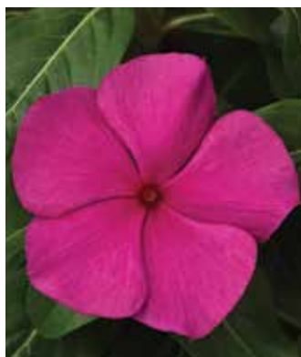
Valiant Magenta Vinca