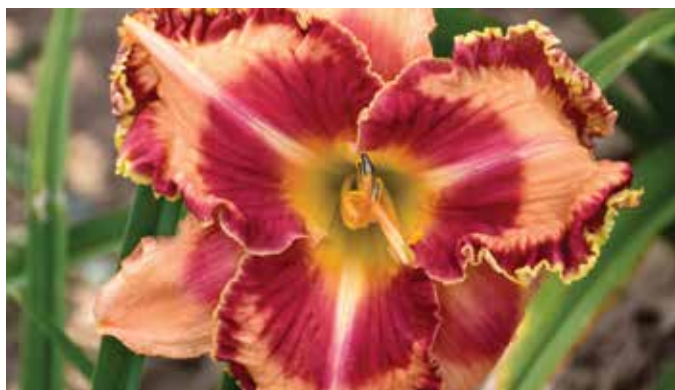
Rainbow Rhythm Lake of Fire Hemerocallis