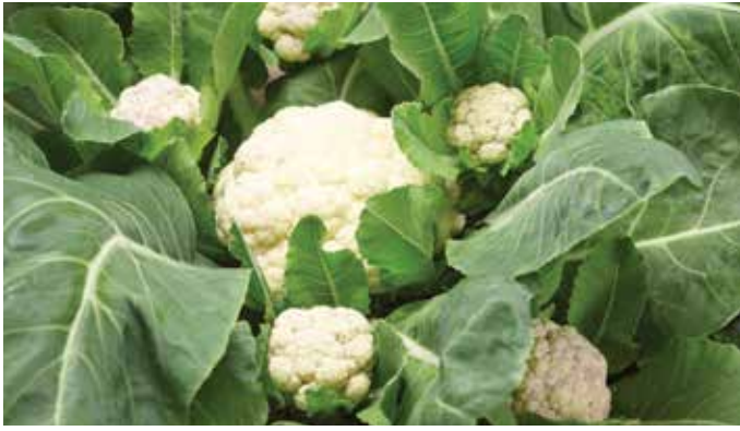
Multi Head White Cauliflower

This sweet, green cabbage has a smooth, dense, cone-shaped head perfect for slicing and shredding. With a long harvest window, you'll get to enjoy more of this sweet, green cabbage. It is resistant to cracking, and is great for sauerkraut and cole slaw.