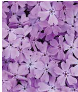
Spring Bling Pink Sparkles Phlox