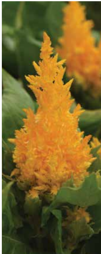
First Flame Yellow Improved Celosia

Early flowering with a compact, uniform habit.