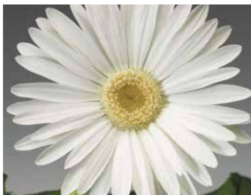
Jaguar White Light Eye