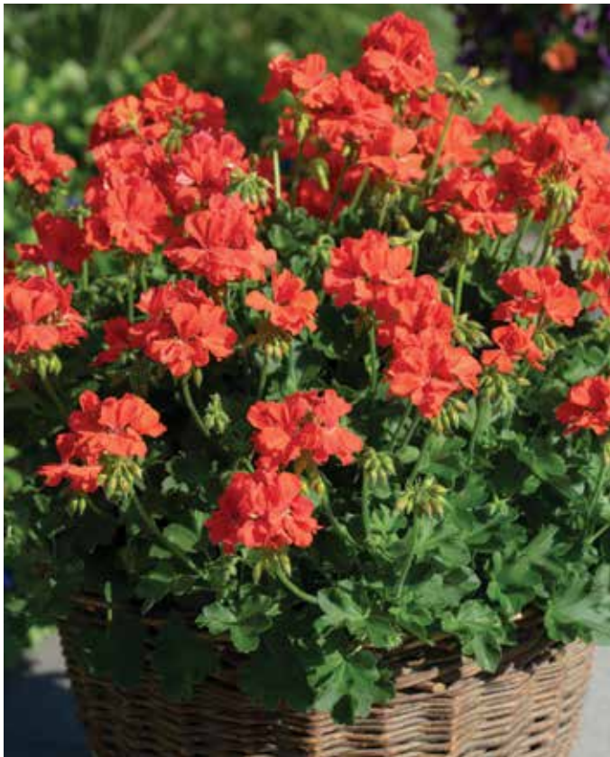
Marcada Deep Coral Geranium