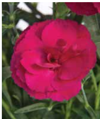
SuperTrouper Purple 21 Dianthus