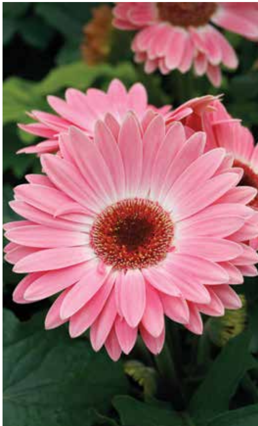
Majorette Pink Halo Improved