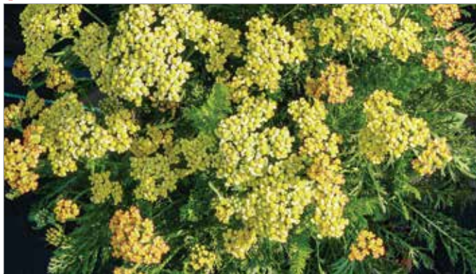
Milly Rock Yellow Achillea