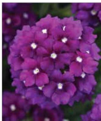
EnduraScape Purple Improved Verbena