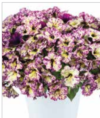
Splash Dance Magenta Mambo