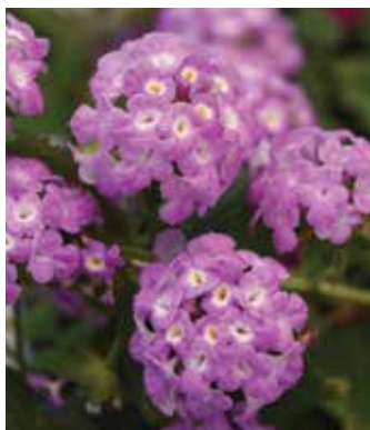
Purple Falls Lantana