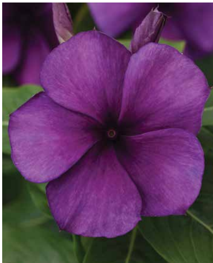
Tattoo Blueberry Vinca