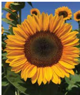
Pro Cut Orange Horizon Sunflower