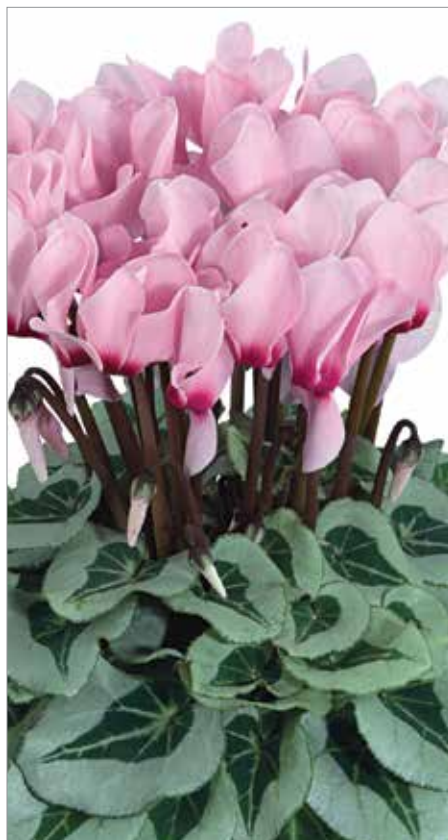
Metalis Light Pink With Eye Cyclamen