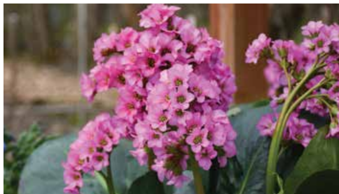
Miss Piggy Bergenia