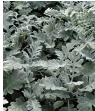
Cineraria maritima candicans Dusty Miller