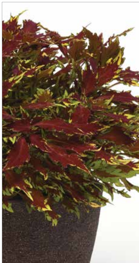
FlameThrower Sriracha Coleus