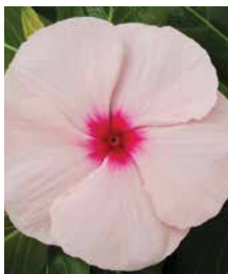
Cora XDR Apricot Vinca

Unique plant for the border; produces silvery-white, felted leaves plus lavender flowers in July, with rosy-lavender bracts and a pleasant sage fragrance. Water-wise and a great pollinator plant.