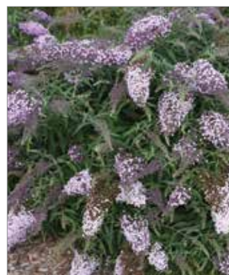
'Lilac Cascade' Buddleia