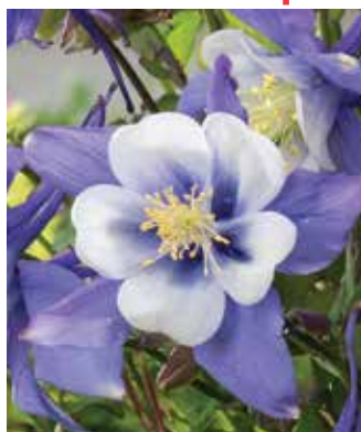
Earlybird Blue White Aquilegia