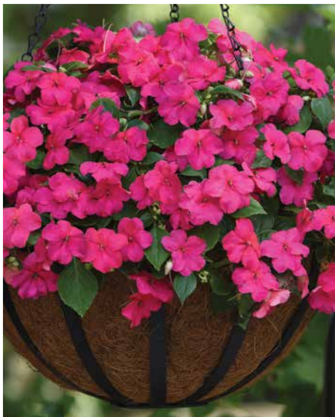
Beacon Rose Impatiens