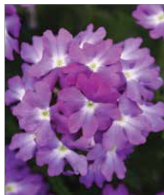
Cadet Upright Lavender Blue Improved Verbena