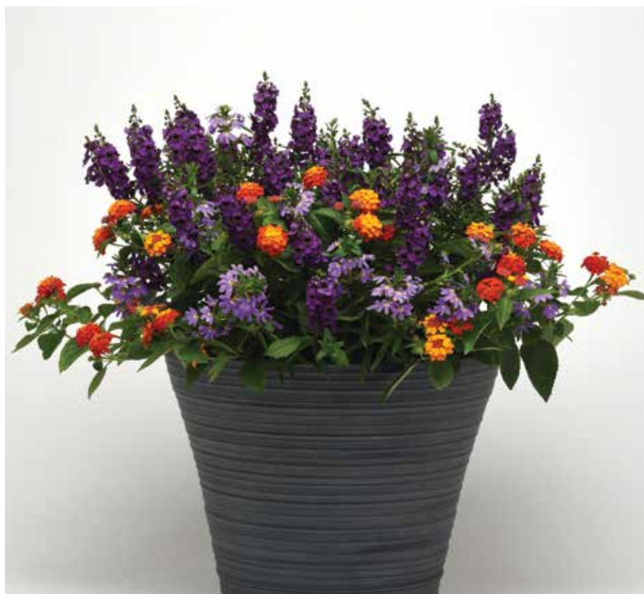
MixMasters Shindig Improved