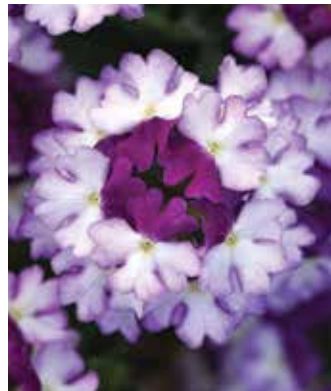
Firehouse Purple Fizz Improved Verbena