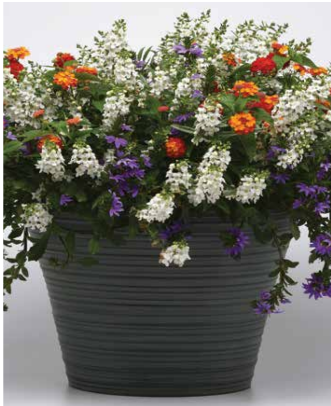
Shindig Improved featuring 'Blue Brilliance'

Brightly colored series features big flowers on a moderate, controlled, semi-trailing habit. A strong option for heat and drought-tolerant programs.