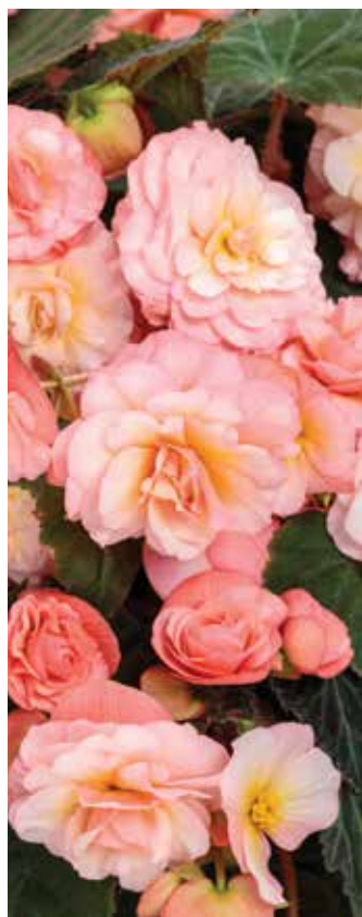
Double Delight Blush Rose