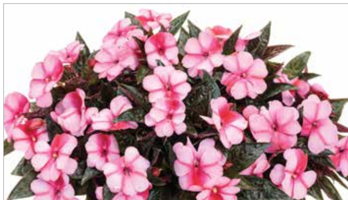
Infinity Blushing Crimson Improved Impatiens