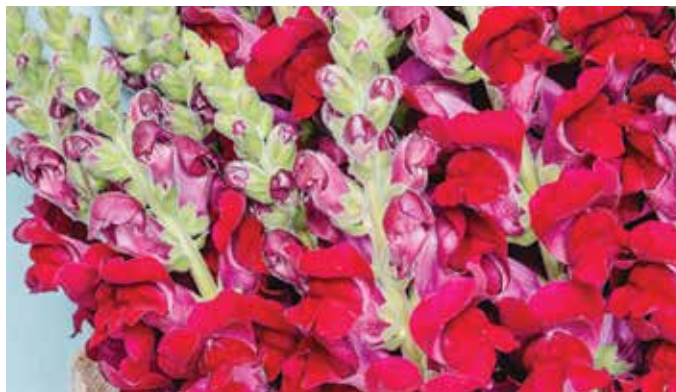
Potomac Red Improved Snapdragon