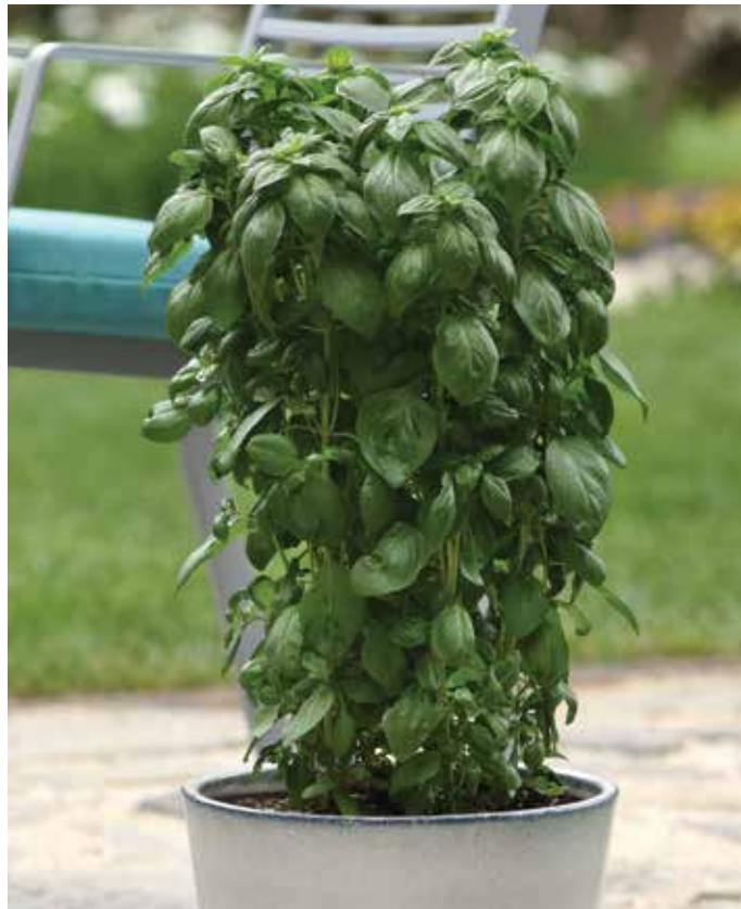
Everleaf Genovese Basil