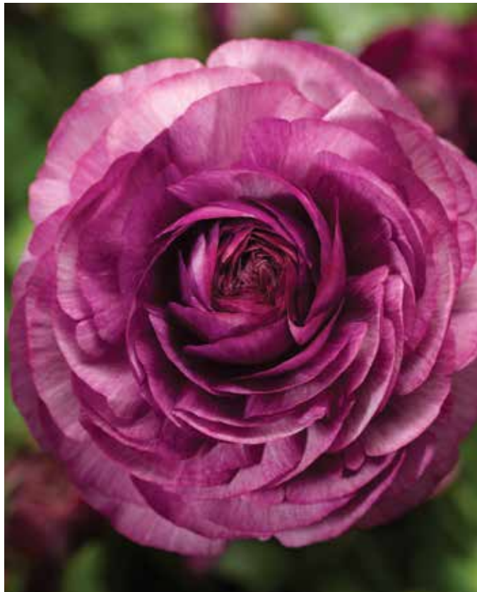
Magic Purple Ranunculus

Compact, well-branched plants finish uniformly between colors. The 2 to 3-in. (5 to 8-cm) blooms are held close to the plant.