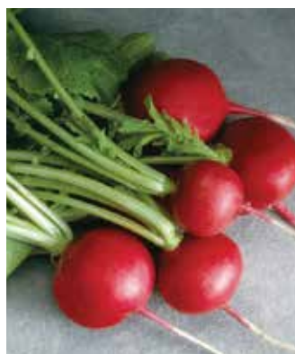
Crunchy Red Radish