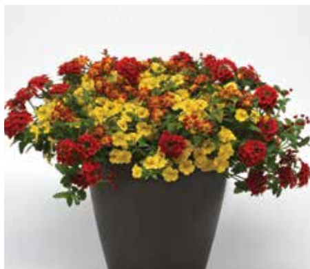
MixMasters Biden My Time