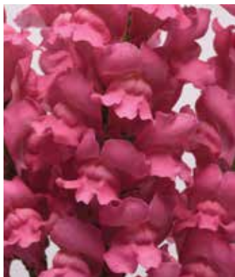
Potomac Pink Improved Snapdragon