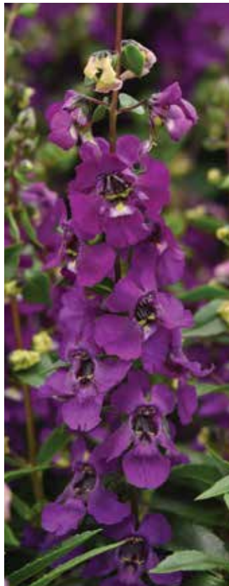
Serena Purple Improved Angelonia