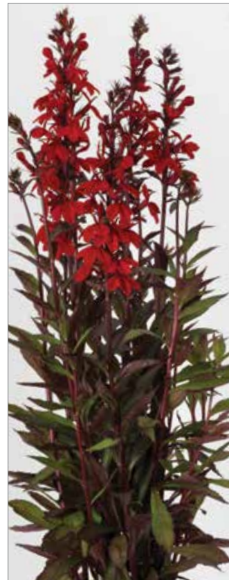
Starship Scarlet Bronze Leaf Lobelia