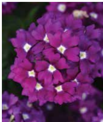
Firehouse Violet Wink Verbena