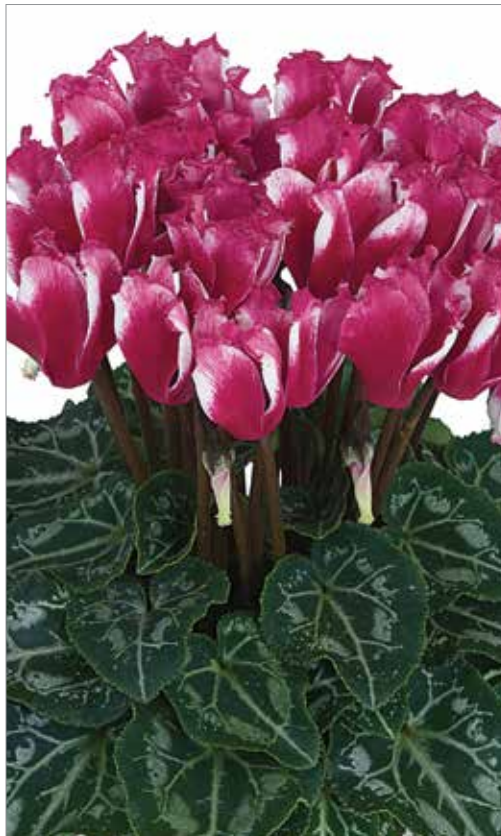
Metis Select Lilibelle Magenta Cyclamen