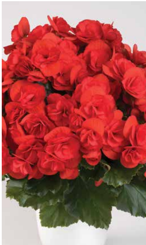
Adonia Ruby Red