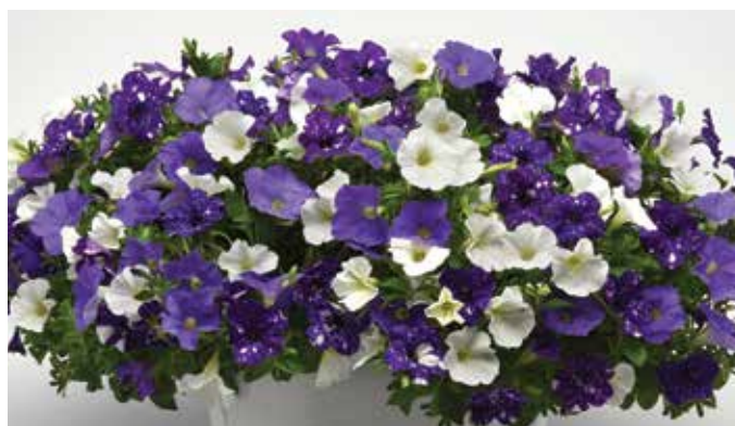
Trixi Sky's the Limit