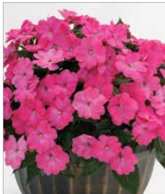
SunPatiens Compact Hot Pink