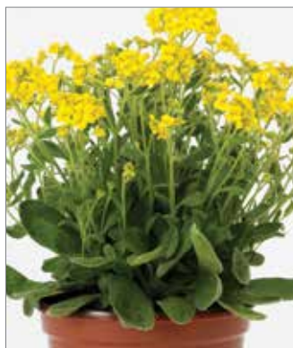
Gold Rush Aurinia