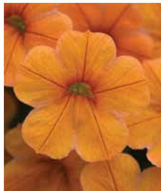
Cha-Cha Tangerine Calibrachoa