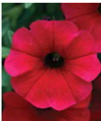
SuperCal Royal Red Petchoa