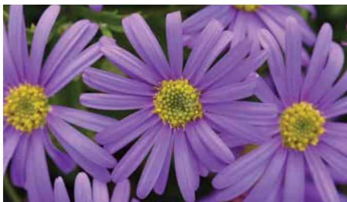
Brasco Violet Brachyscome

Smaller version of Sun Drop Double Yellow. Perfect for small pot production and plays nice in mixed containers. Also, best for the southern region. Produces double flowers with a better habit and a more saturated yellow than other compact double bidens on the market.