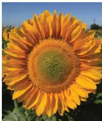
Pro Cut Gold Lite DMR Sunflower