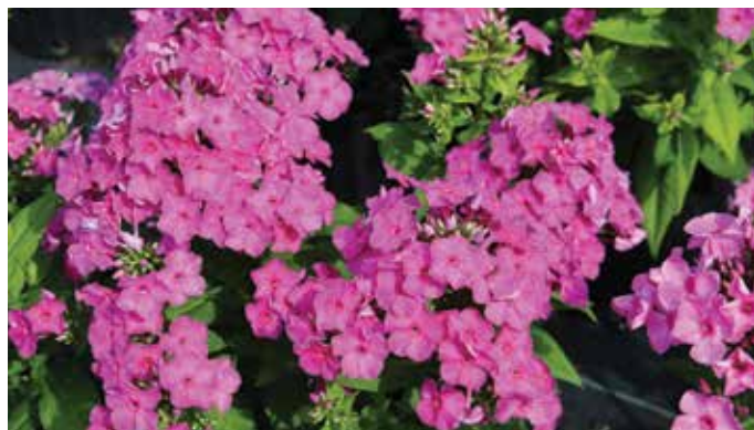
Super Ka-Pow Pink