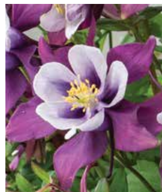
Earlybird Purple White Aquilegia