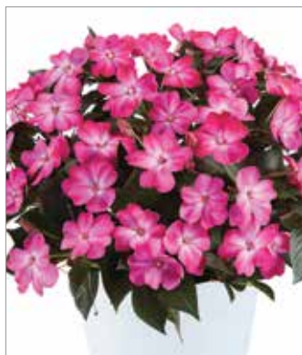
Sol Luna Pink