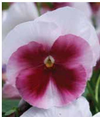
Spring Grandio Beacon Rose Pansy