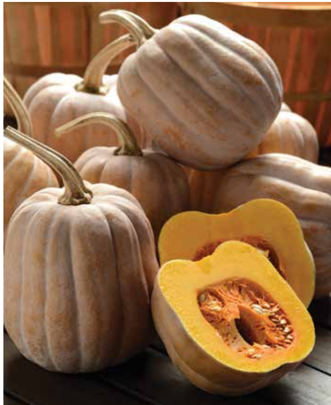
Autumn Frost Squash

The world's first F 1 hybrid super-hot chili measuring at 1.2 million scovilles. This gives a fantastic grower advantage in terms of improved plant vigor and fruit uniformity. It is the earliest maturing super-hot variety, at least 14 days earlier than the competition.