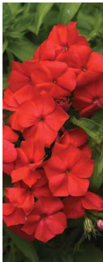
Gisele Scarlet Phlox