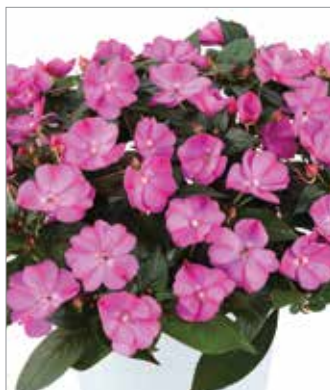
Sol Luna Dark Lavender