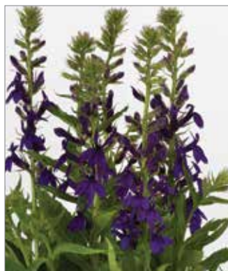
Starship Blue Lobelia