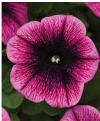
Starlet Blueberry Vein