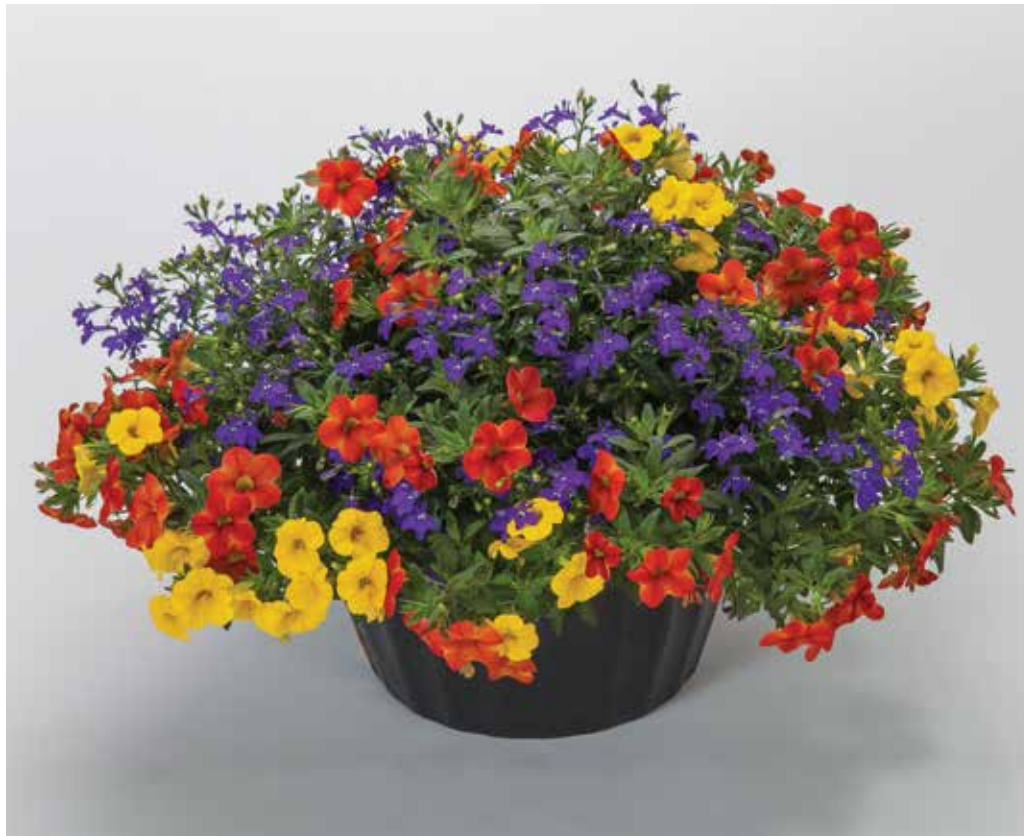
Kwik Kombos Harvest Moon Mix