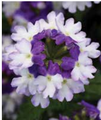
Firehouse Blue Fizz Verbena