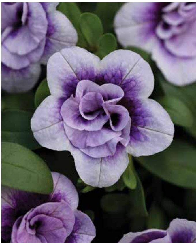
MiniFamous Neo Double PlumTastic