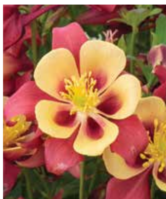
Earlybird Red Yellow Aquilegia