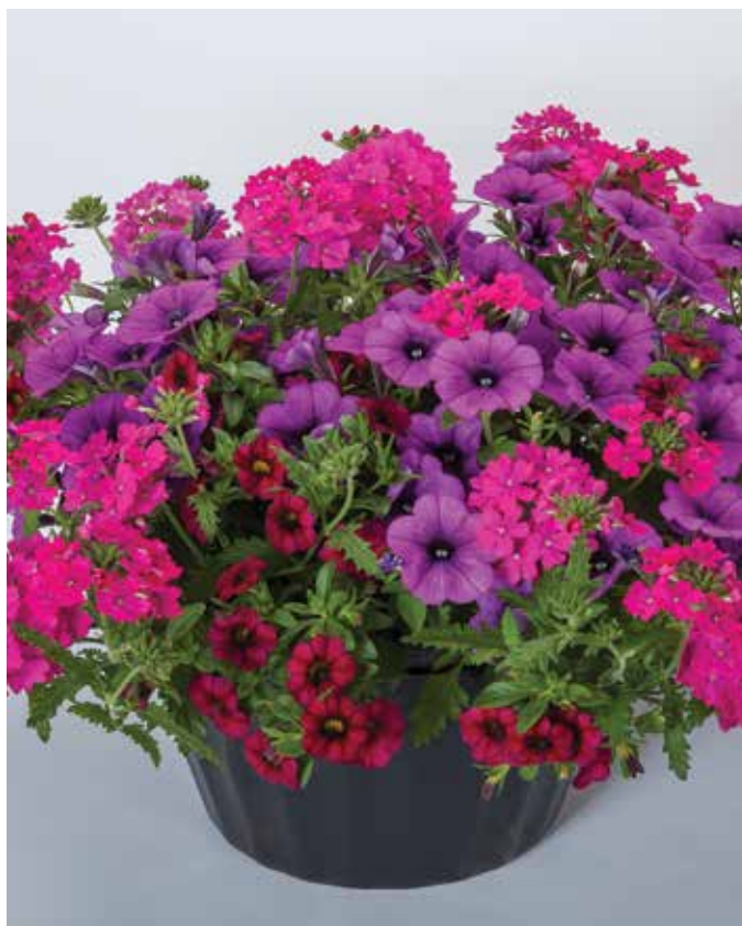
Kwik Kombos Mermaid Tails Mix