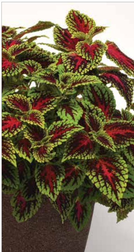
Dragon Heart Coleus