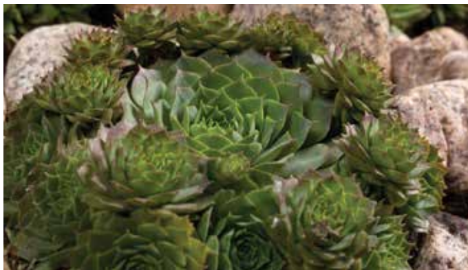
Hippie Chicks Apex Sempervivum