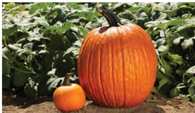
Large Marge Pumpkin