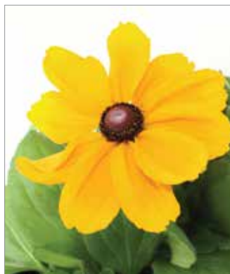
Dakota Gold Rudbeckia