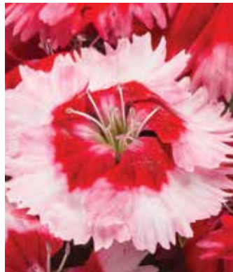
Venti Parfait Strawberry Shades Dianthus