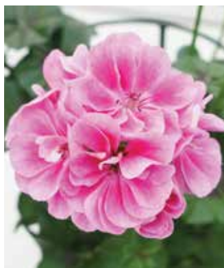
Royal Pink Ice