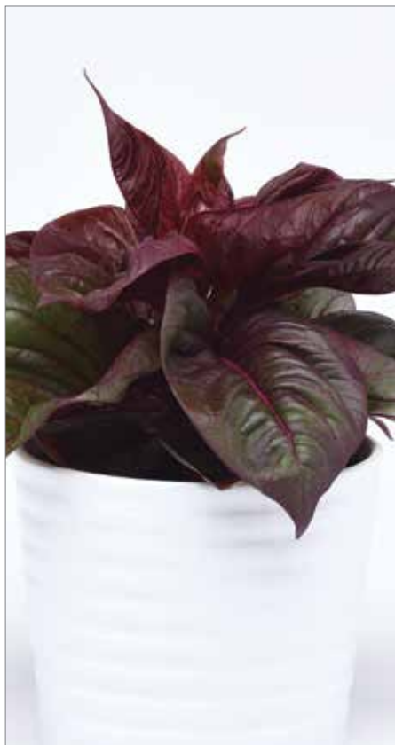
Sol Lizzard Leaf Foliage Celosia