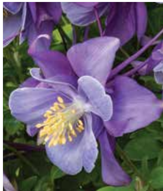
Earlybird Purple Blue Aquilegia