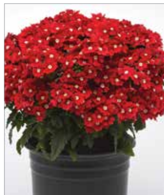
Cadet Upright Red Improved Verbena