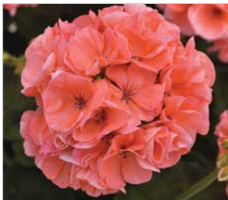
Dynamo Salmon Improved