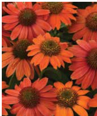
Artisan Red Ombre Echinacea