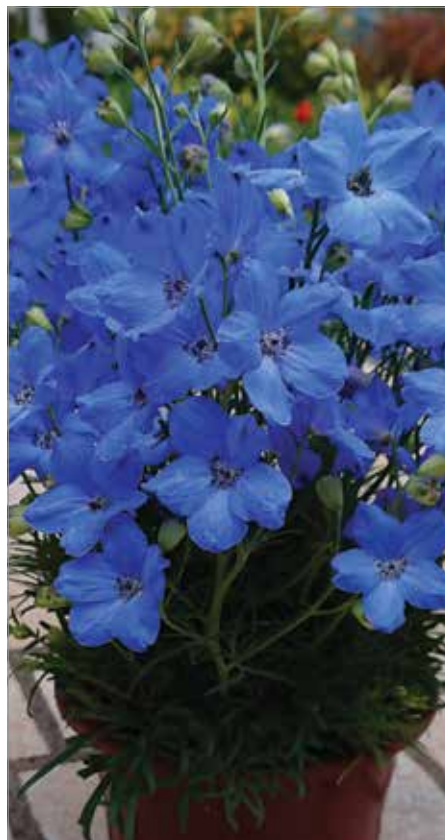
Cheer Blue Delphinium