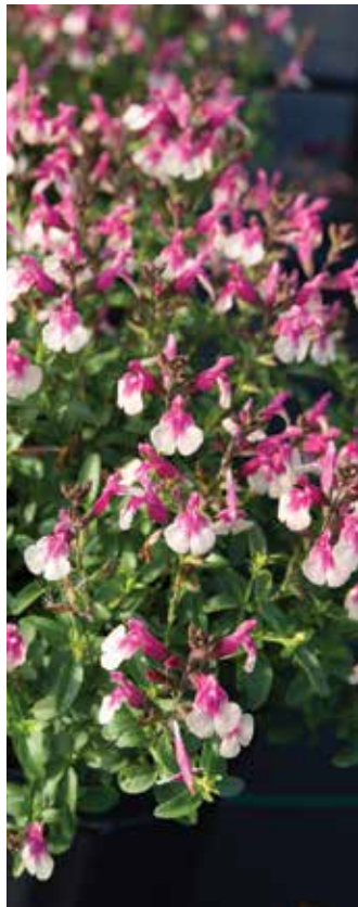
Mirage Rose Bicolor Salvia