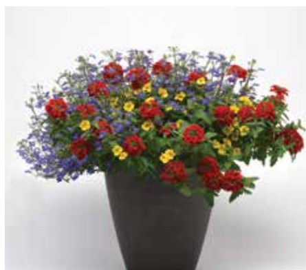
MixMasters Color Magic Improved