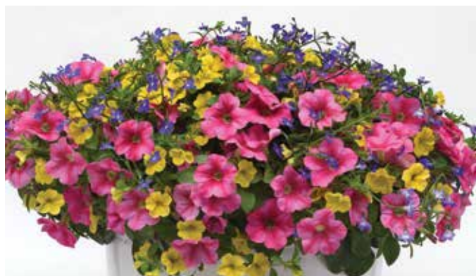
Trixi Lip Sync