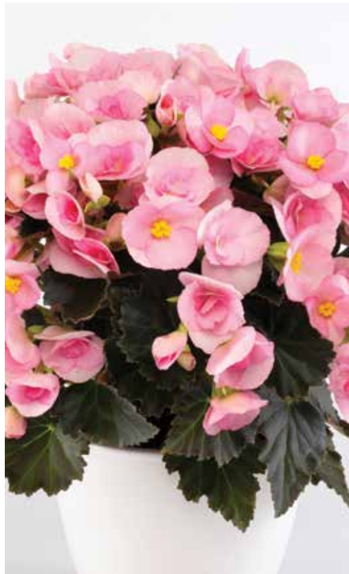
Adonia Light Pink