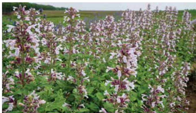
Whispurr Pink Nepeta