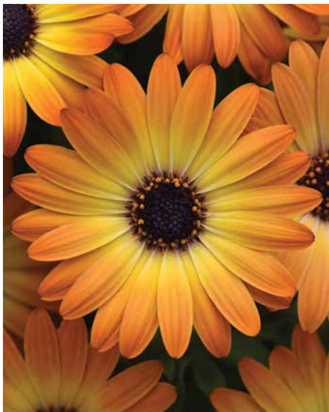
'Sunshine Beauty' Osteospermum