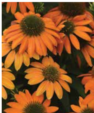
Artisan Soft Orange Echinacea