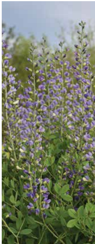
Decadence Deluxe Blue Bubbly Baptisia