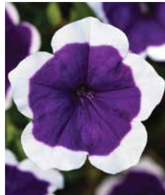
Headliner Dark Violet Picotee 21