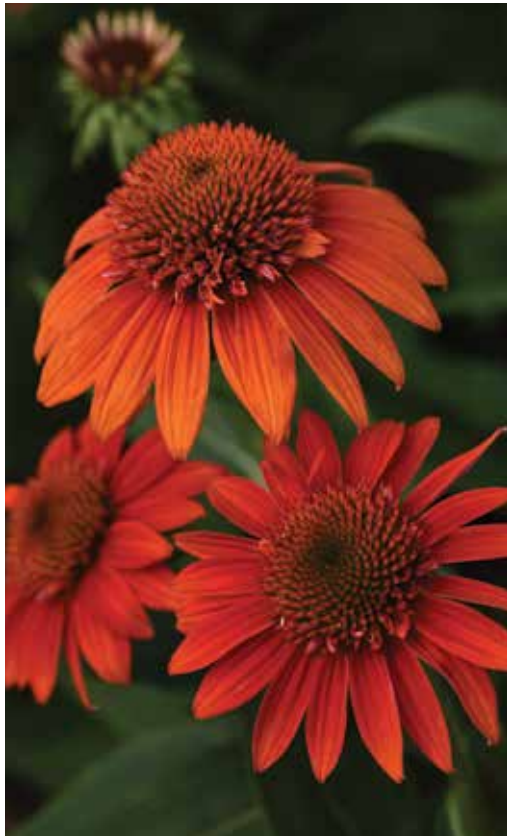
Sombrero Fiesta Orange