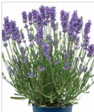
BeeZee Light Blue