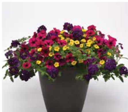
MixMasters Bejeweled Improved