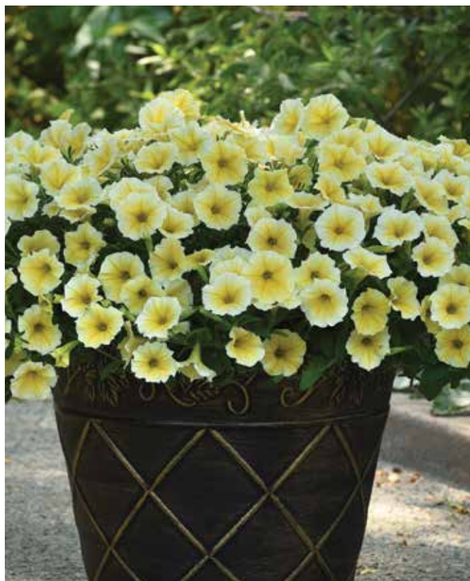
Bee's Knees Petunia