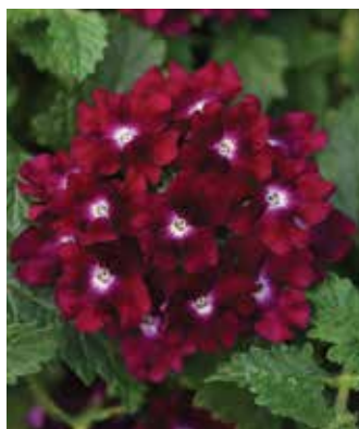
Lascar Purple Verbena