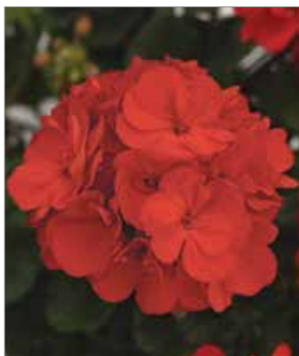
Presto Brilliant Red Improved