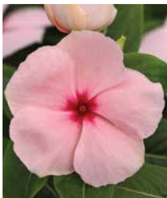
Valiant Apricot Improved Vinca