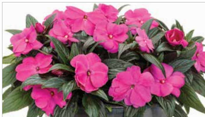
Infinity Light Purple Improved Impatiens