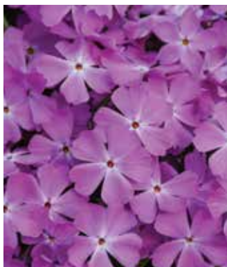
Spring Bling Rose Quartz Phlox