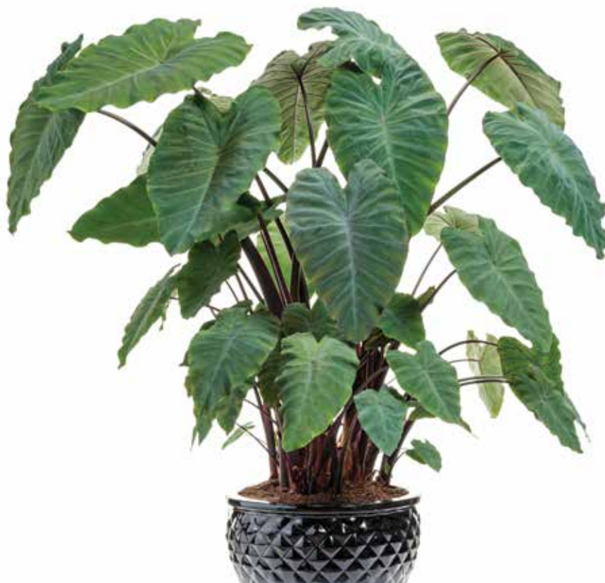
Heart of the Jungle Colocasia