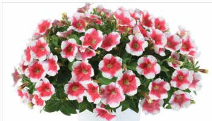
Capella Cherry Vanilla