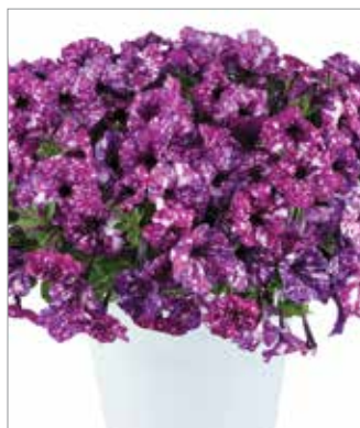
Splash Dance Purple Polka