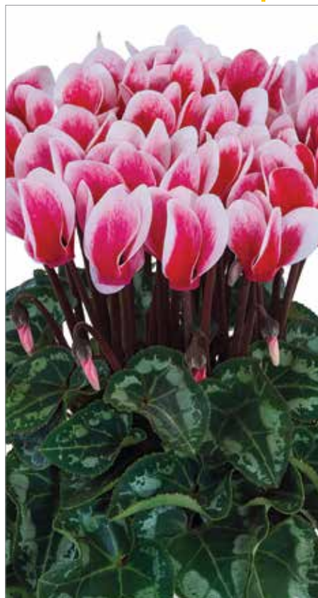
Metis Select Fantasia Artic Red Cyclamen