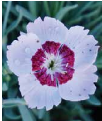
Mountain Frost Ruby Snow