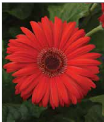
ColorBloom Red with Dark Eye