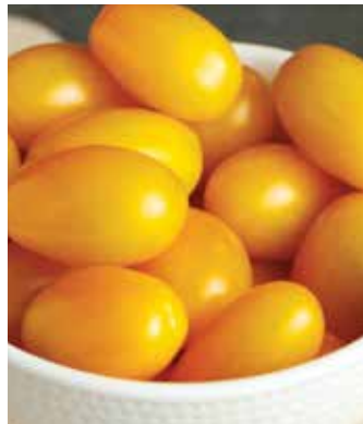
Gold Spark Tomato