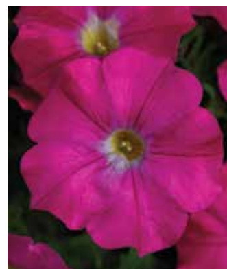
SuperCal Rose Petchoa