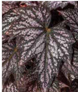
Bewitched Silver Begonia