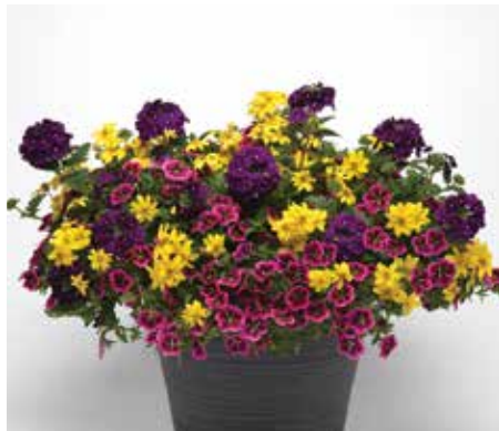
MixMasters Kiss Me Good Night