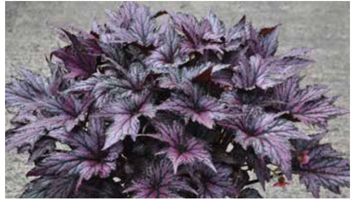
Bewitched Pink Begonia