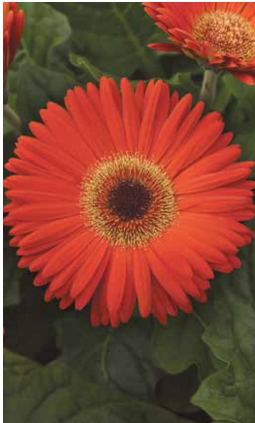
Revolution Deep Orange with Dark Eye

Revolution is the leading standard-size pot gerbera in uniformity across a complete color range. Offers a better second flush of flowers than the competition for a longer bloom time. Industry-leading seed quality.