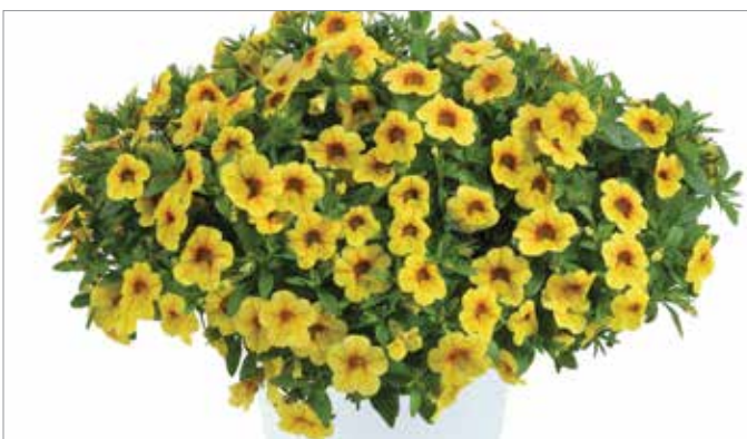
Colibri Mellow Yellow