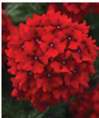
EnduraScape Red Improved Verbena