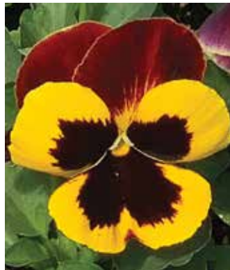
Matrix Red Wing Improved Pansy