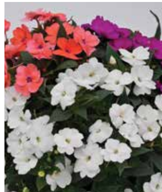
SunPatiens Compact Forever Summer Mix