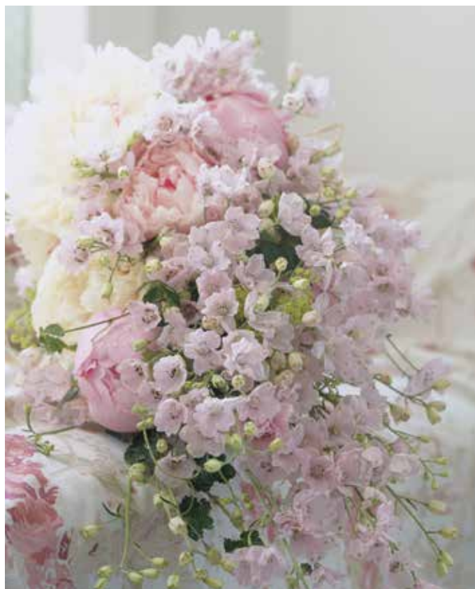
Jenny's Pearl Pink Delphinium