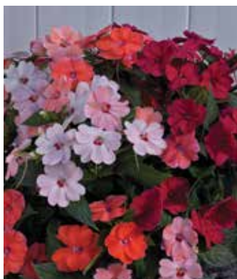
SunPatiens Vigorous Lovebird Improved Mix Impatiens