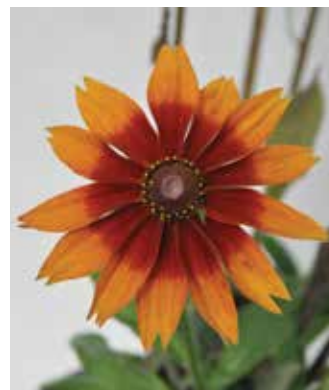
Dakota Red Shield Rudbeckia