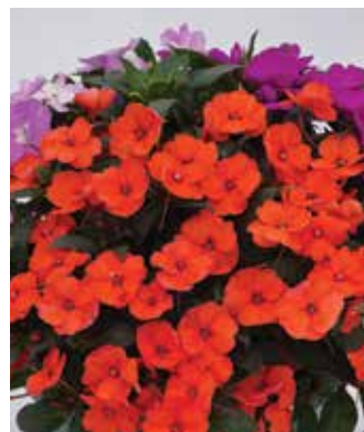
SunPatiens Compact Tropical Punch Mix