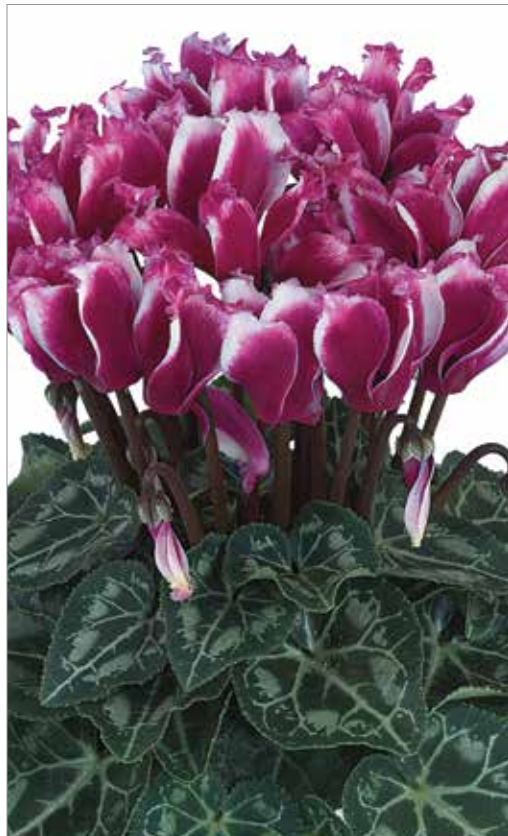
Metis Select Lilibelle Bright Purple Cyclamen