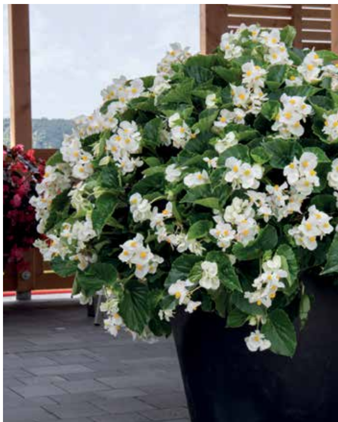
BIG White With Green Leaf