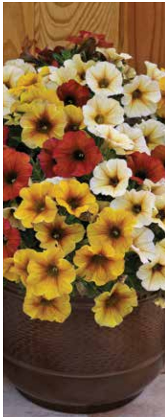
SuperCal Premium Bonfire Mix Petchoa

The best characteristics of petunias and calibrachos, in one exceptional collection. Unique, vibrant colors, large blooms and high pH tolerance.