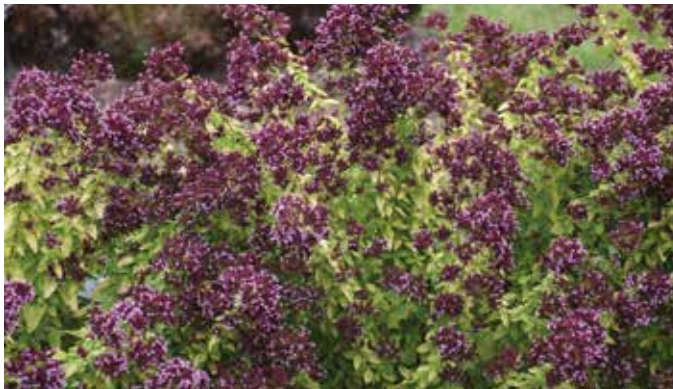
Drops of Jupiter Origanum