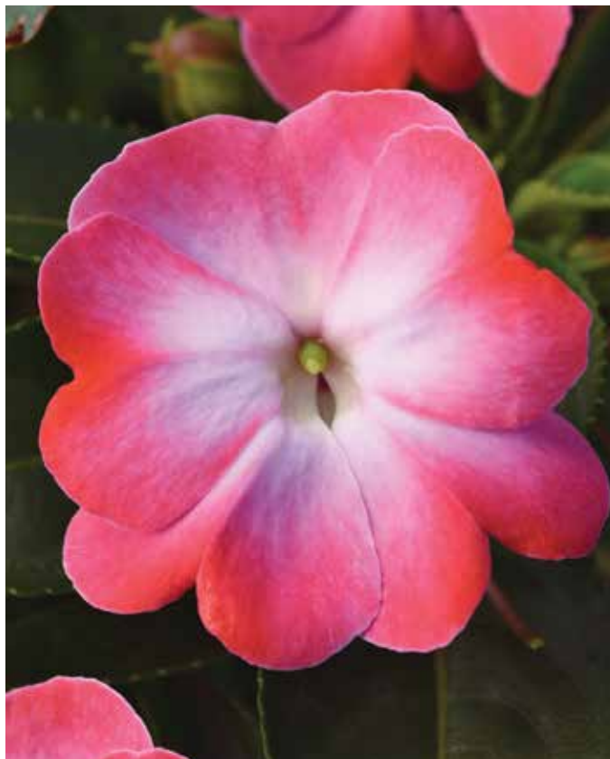
ImPower Pink Frost