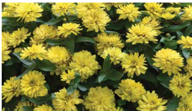
Double Zahara Yellow Improved Zinnia