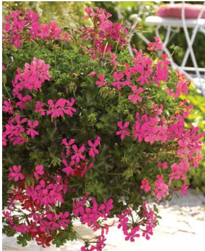
Decora Shocking Pink