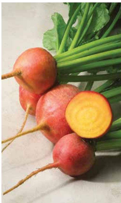
Touchstone Gold Beet