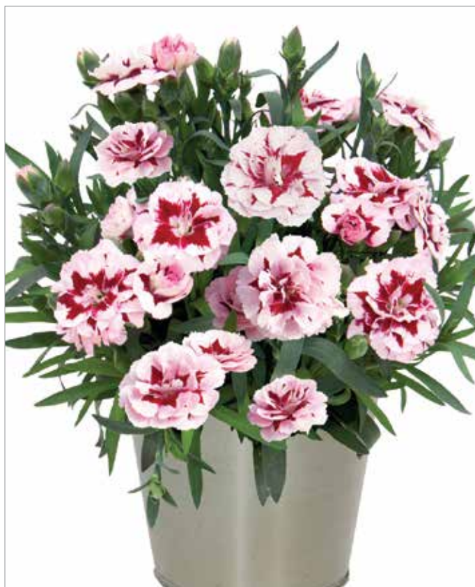
Oscar Purple Star 21 Dianthus