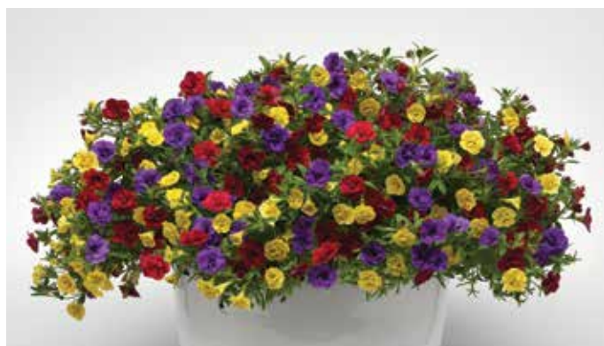
Trixi Double Date 21