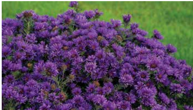
'Grape Crush' Aster