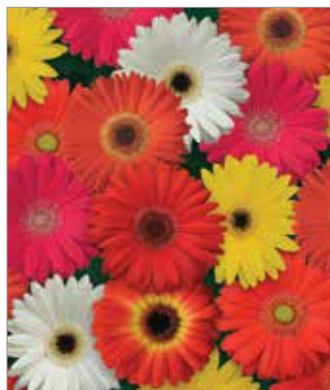
ColorBloom Mix Improved

Stays compact – won't get too full or leafy, allowing the colorful blooms to show through in quarts (11-cm) pots. Faster to flower by around 10 days, ColorBloom beats the competition to market.