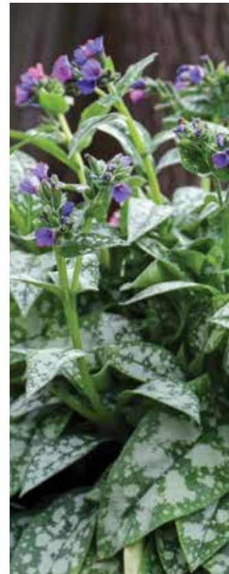
Spot On Pulmonaria