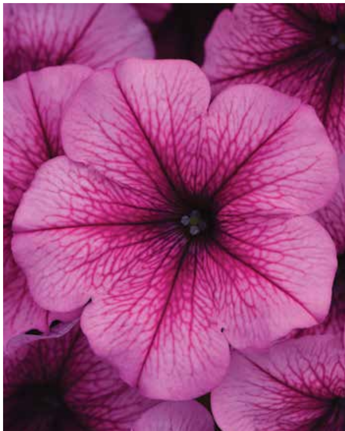
Easy Wave Rose Fusion Petunia

Huge, golden yellow flowers up to 6 in. (15 cm) in diameter; tolerates rain well.