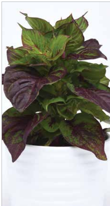
Sol Gekko Green Foliage Celosia