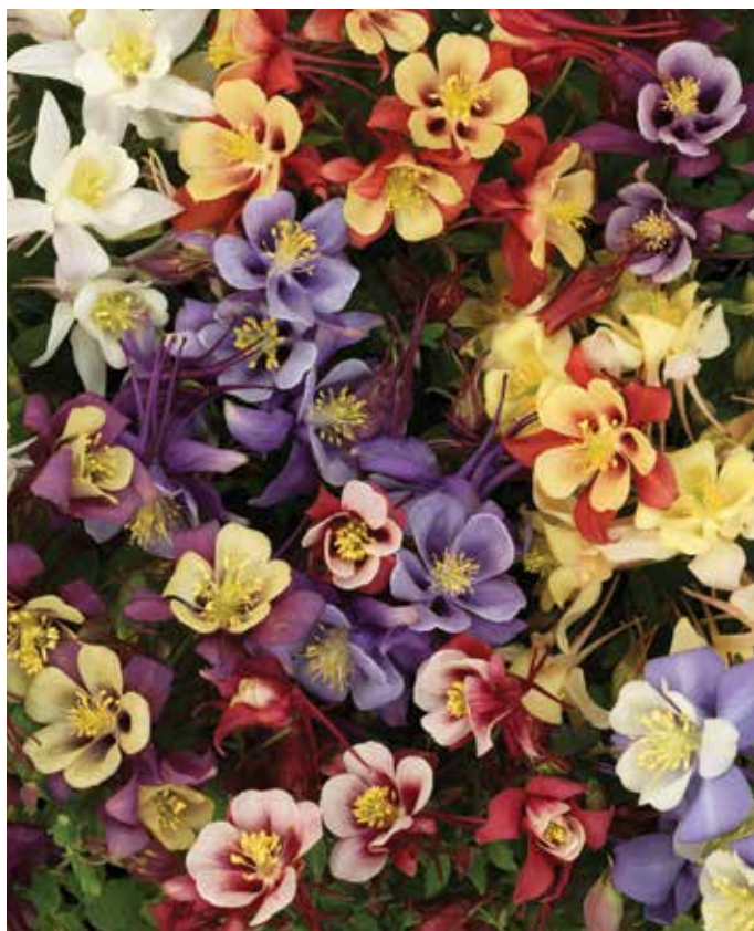
Earlybird Mix Aquilegia