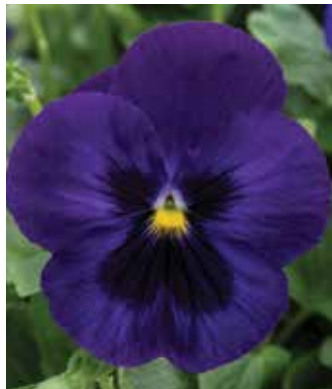
Spring Grandio Deep Blue With Blotch Improved Pansy