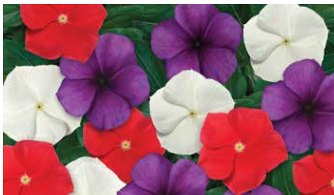
Tattoo American Pie Mix Vinca