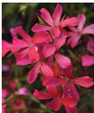
Balcon Shocking Pink

Now available from Ball Seed. A sea of colorful, large, single flowers cascades over the edge of large hanging baskets and window boxes on this heat-tolerant, trailing ivy. It is naturally self-cleaning to keep gardens looking fresh long into the Summer.