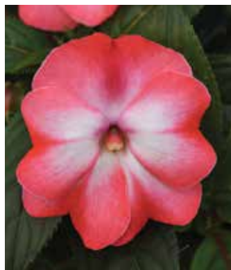
ColorPower Peach Frost New Guinea Impatiens