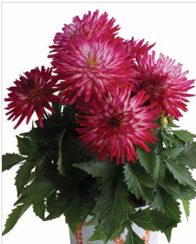
Megaboom Berry Blast Dahlia