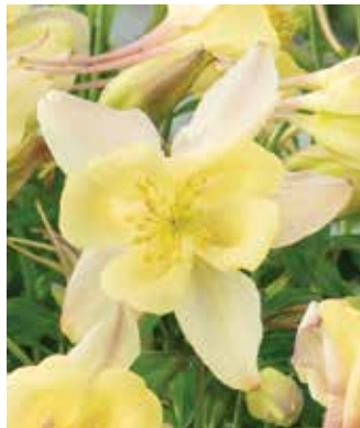
Earlybird Yellow Aquilegia