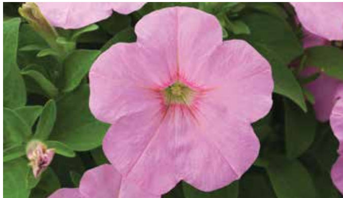
Trilogy Pink Lips Petunia