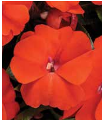
Infinity Orange Improved Impatiens