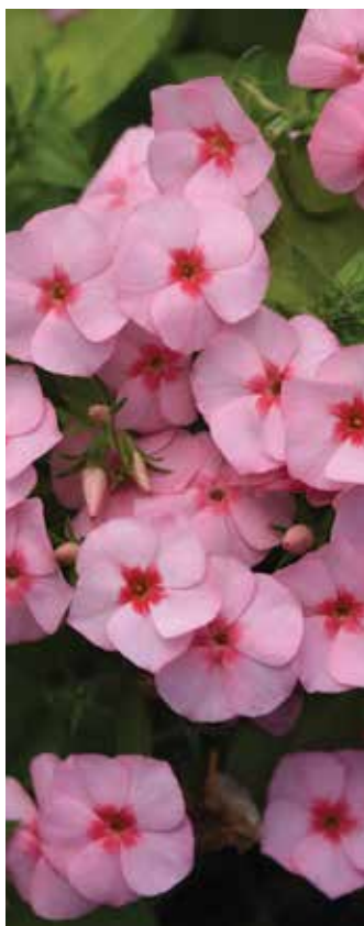
Gisele Light Pink+Eye Phlox