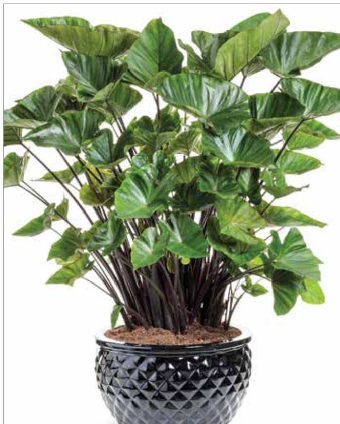
Coffee Cups Colocasia