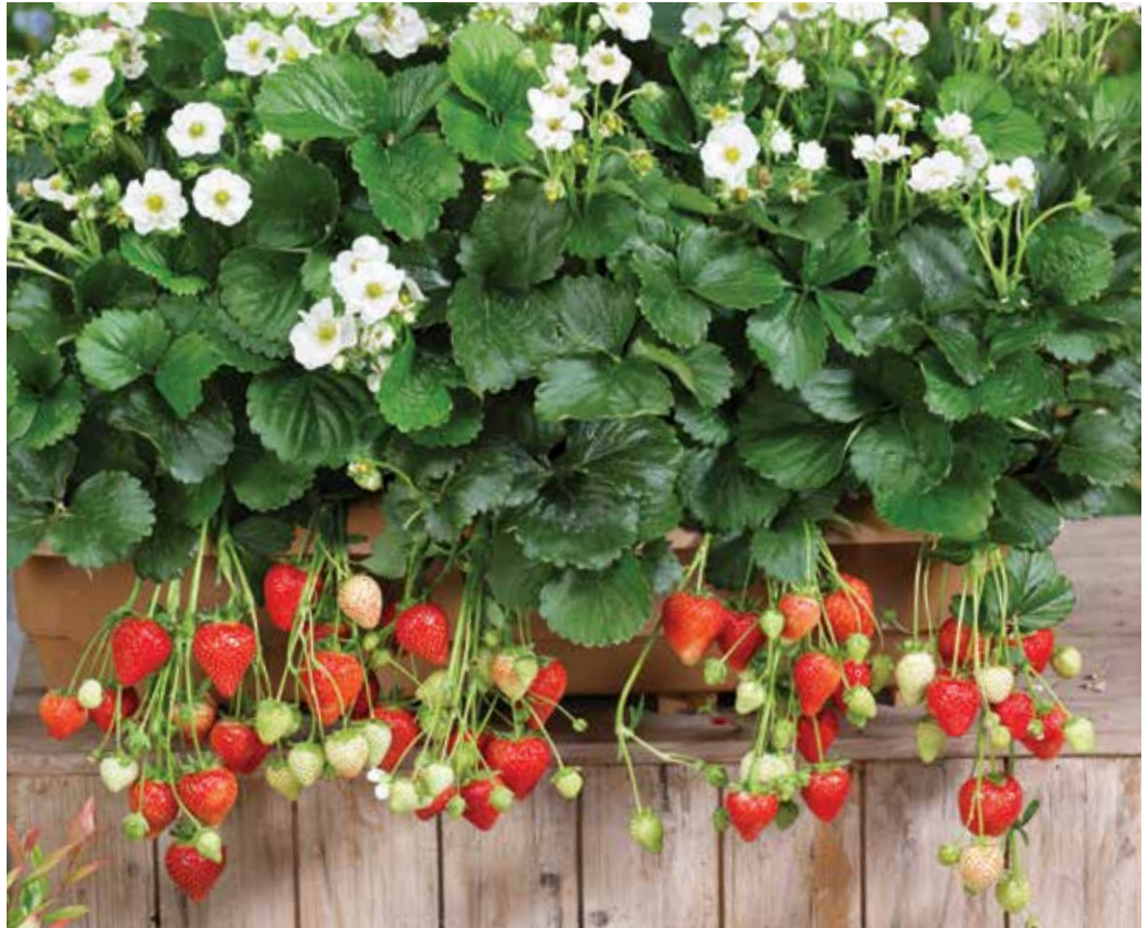
Summer Breeze Snow Strawberry

Rose-shaped double flowers are real eye-catchers! Rose gets a companion in Snow, with double white flowers that resemble a snow shower in Summer and don't stop blooming until Fall. Aromatic, medium-sized, conical bright red fruit is produced on both all season long.