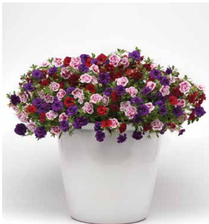
Trixi Double Take