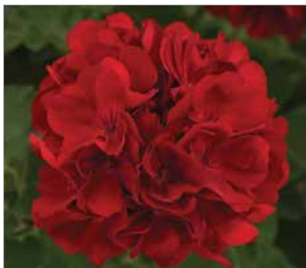
Dynamo Dark Red Improved