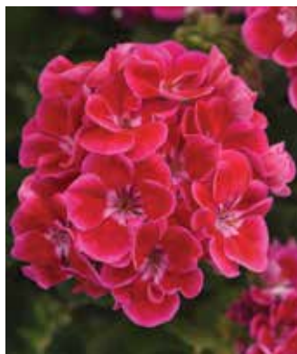
Presto Rose Flare