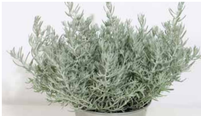
Silver Stitch 21 Helichrysum