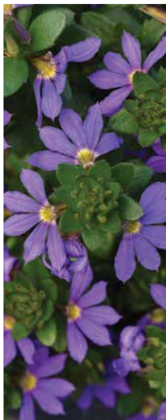
'Blue Brilliance' Scaevola