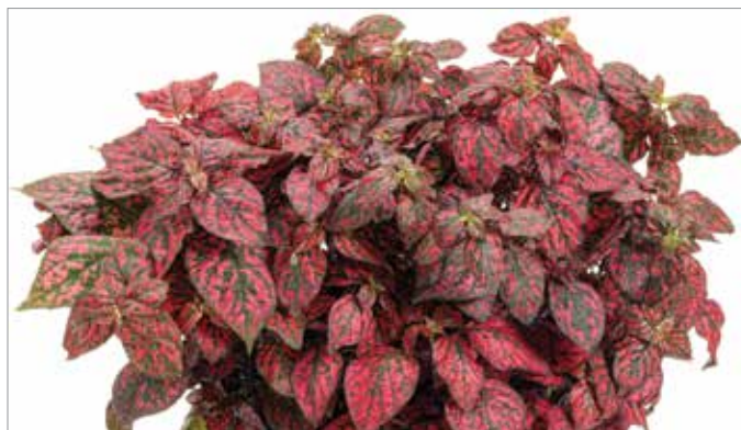
Hippo Red Improved Hypoestes