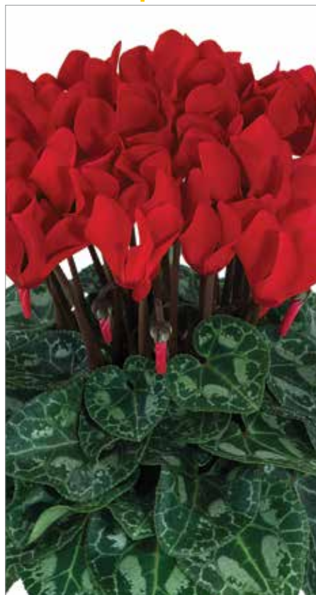
Smartiz Red Cyclamen