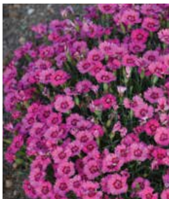
Paint the Town Fancy