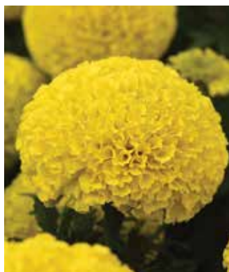
Marvel II Yellow African Marigold