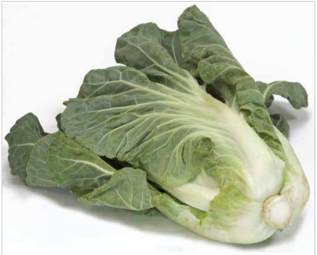
Sweet Thang Cabbage

Easily branches with multiple heads per plant. Small leaves. Never turns bitter in the sun.