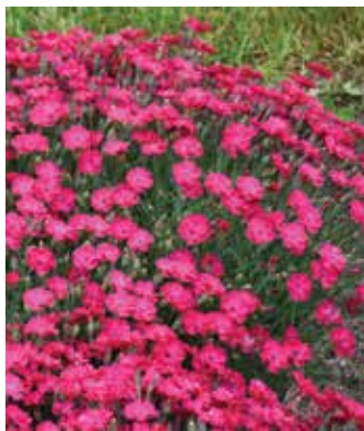
Paint the Town Red