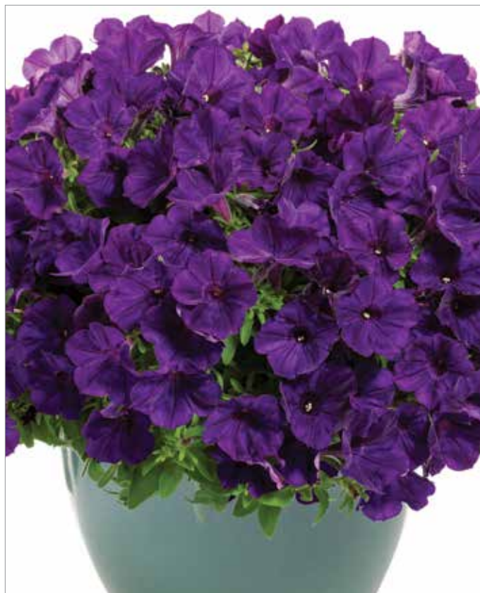
Supertunia Royal Velvet Improved