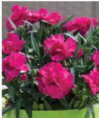
SuperTrouper Purple 21 Dianthus

Pot carnation is a strong performer in pots and gardens. Series features an upright habit, double flowers, an excellent color range and a wonderful fragrance.