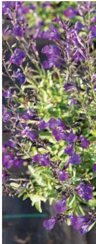
Mirage Blue Salvia