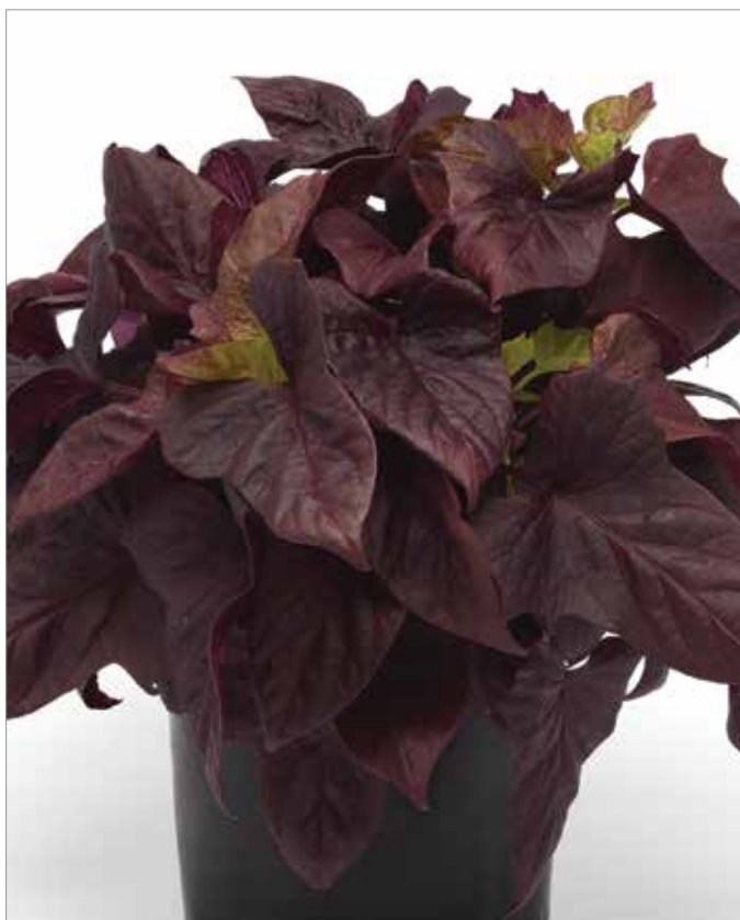
Spotlight Red Heart Ipomoea