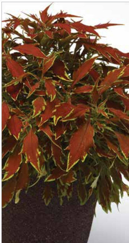
FlameThrower Cajun Spice Coleus