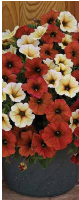
SuperCal Premium Autumn Spice Mix Petchoa