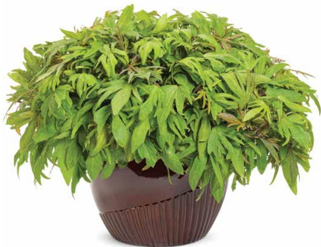
Proven Accents Sweet Caroline Medusa Green Ipomoea