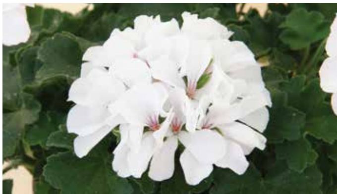
Marcada White Geranium