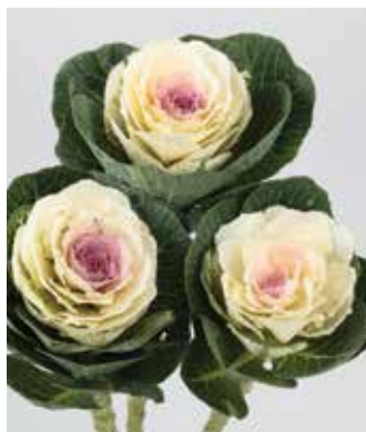
Condor White Flowering Kale