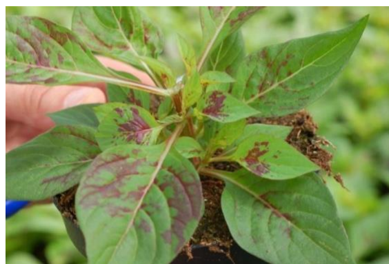
Pinched and branching. Note: Pinch “hard”, not “soft”