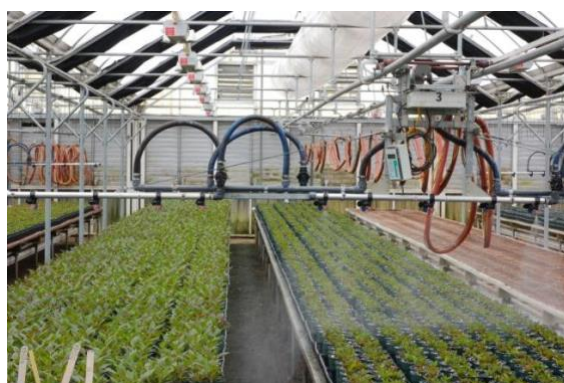
Note: Ideal propagation area - direct stick URC, mist (boom here) propagation, night lighting (HID lights here), bottom heat under the containers.