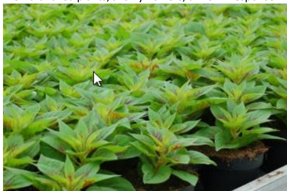
Ready to pinch—excellent take off and uniformity.