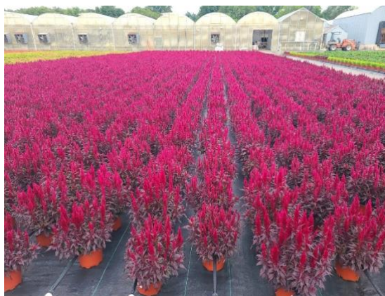
Well-branched plants, showy flowers, uniform response

Note: Schedule for Intenz series. Twisted and Floriosa series flower 1 week later.