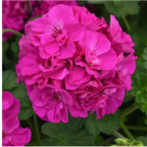
Purple Coming in 2026!