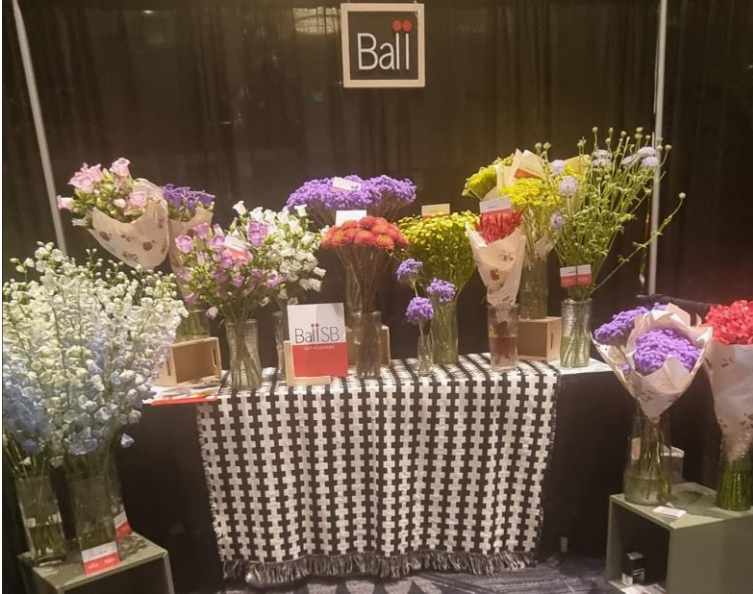
HEB SHOW TEXAS 2024