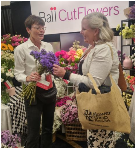
FUN N SUN CA 2024