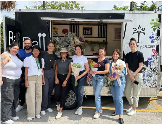
FLOWER TRUCK MIAMI 2024