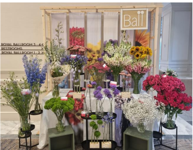
SAF ANNUAL CONV. MIAMI 2024