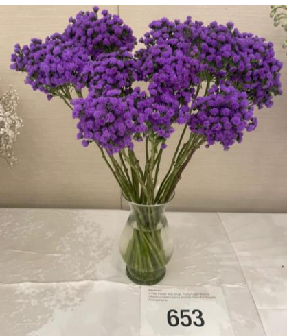
SAF VARIETY COMPETITION