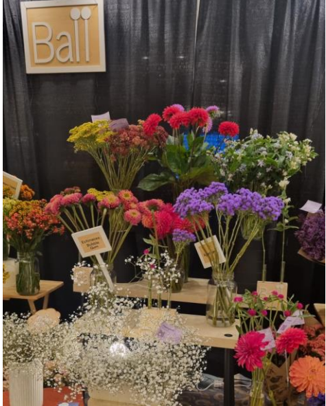
WWFSA SHOW MIAMI 2024