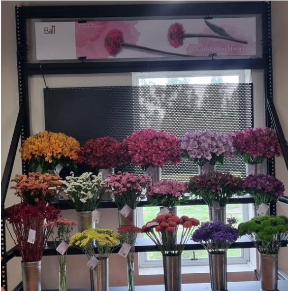
OPEN DAYS COLOMBIA 2024