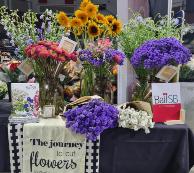
ALBERSTON'S SHOW BOISE 2024