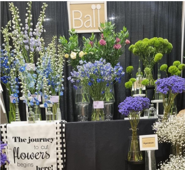
IFPA BREEDERS SHOWCASE CA 2024