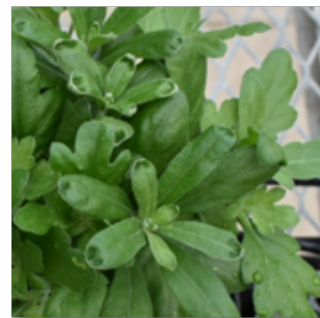
Fig. 1. Crown buds surrounded by non-lobed leaves.

The identifiable feature of crown buds is a change in leaf morphology from lobed leaves to non-lobed leaves, otherwise known as strap leaves (Fig. 1).