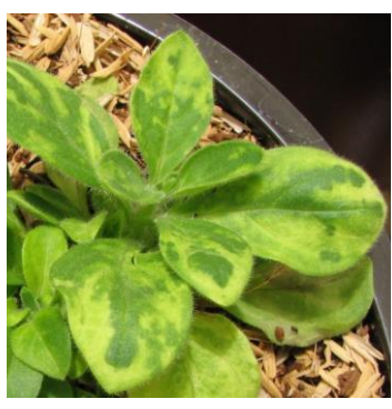
Mosaic symptoms on petunia from tobacco mosaic virus (TMV).