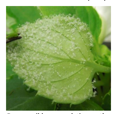
Downy mildew sporulation on the underside of an impatiens leaf.